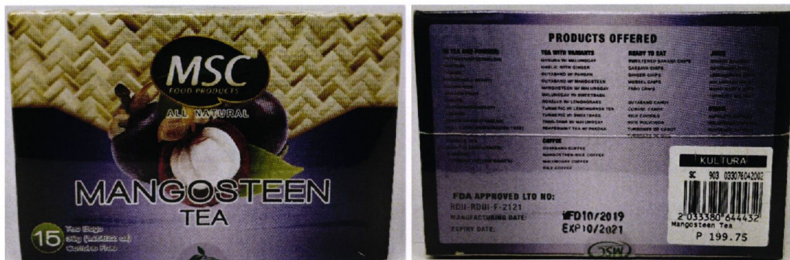
Figure 4. Unregistered MSC FOOD PRODUCTS All Natural Mangosteen Tea