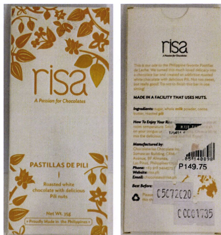
Figure 3. Unregistered RISA A PASSION FOR CHOCOLATES Pastillas de Pili Roasted White Chocolate with Delicious Pili Nuts