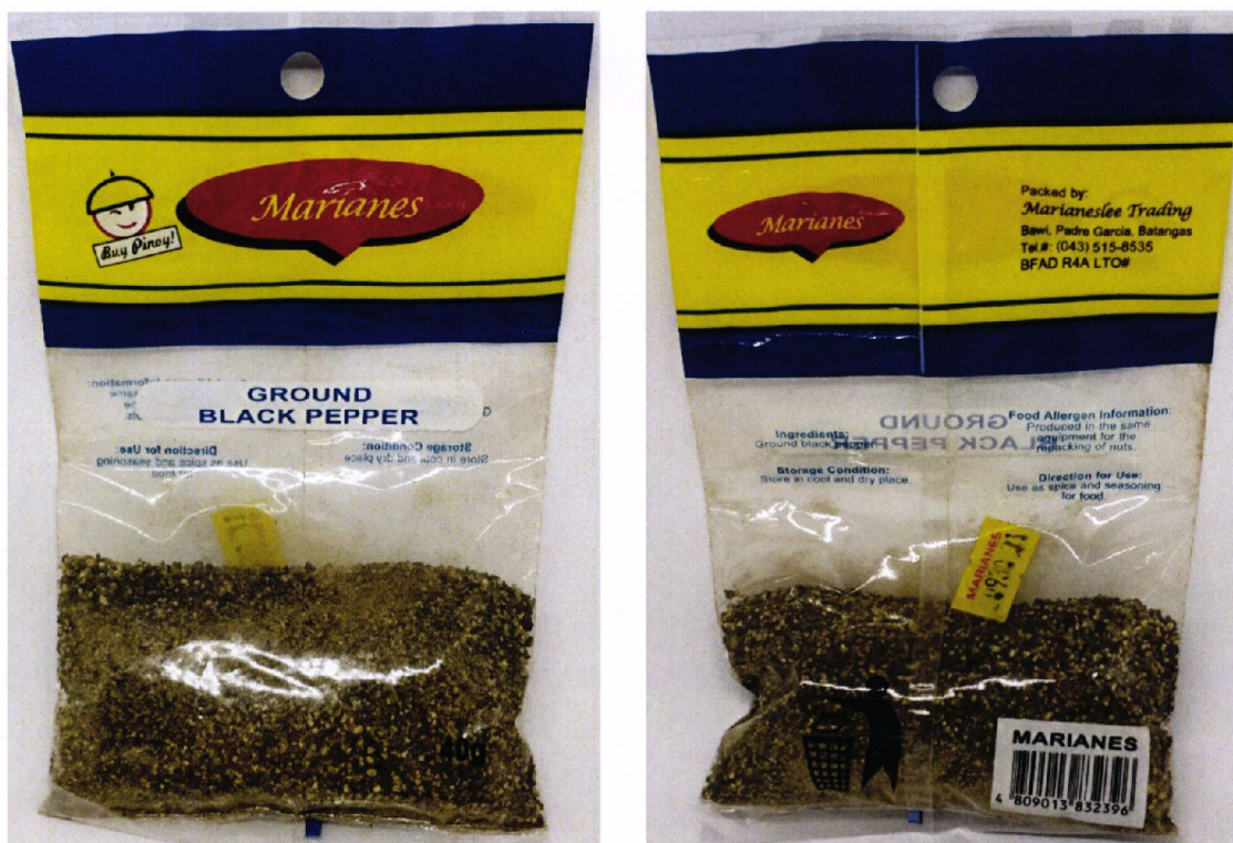
Figure 1. Unregistered MARIANES Ground Black Pepper

The Food and Drug Administration (FDA) advises the public from purchasing and consuming the following unregistered food products: