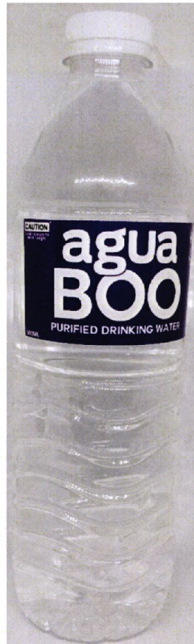
Figure 3. Unregistered AGUA BOO Purified Drinking Water