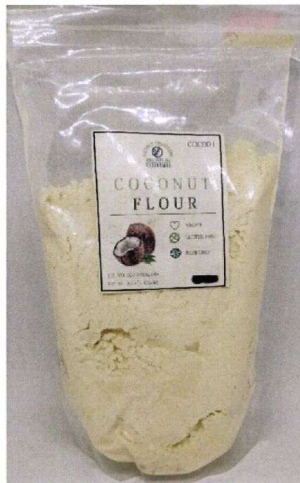
Figure 5. Unregistered CLOTHELY COLLECTIONS KETO FOODS AND ESSENTIALS Coconut Flour

The FDA verified through post-marketing surveillance that the abovementioned food supplement and food products are not authorized and the Certificates of Product Registration (CPR) have not been issued. Pursuant to the Republic Act No. 9711, otherwise known as the “Food and Drug Administration Act of 2009”, the manufacture, importation, exportation, sale, offering for sale, distribution, transfer, non-consumer use, promotion, advertising or sponsorship of health products without the proper authorization is prohibited.