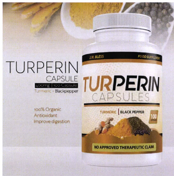
Figure 1. Unregistered J.M. BLESS TURPERIN Turmeric Black Pepper Food Supplement Capsules

The Food and Drug Administration (FDA) advises the public from purchasing and consuming the following unregistered food supplement and food products: