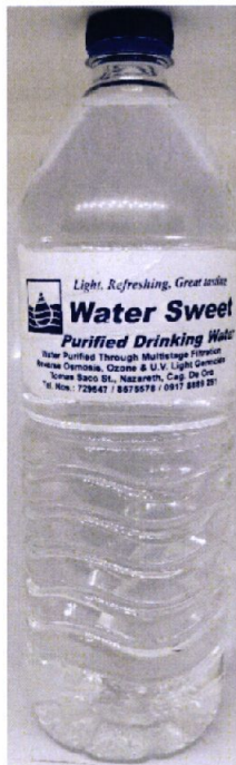
Figure 4. Unregistered WATER SWEET Purified Drinking Water