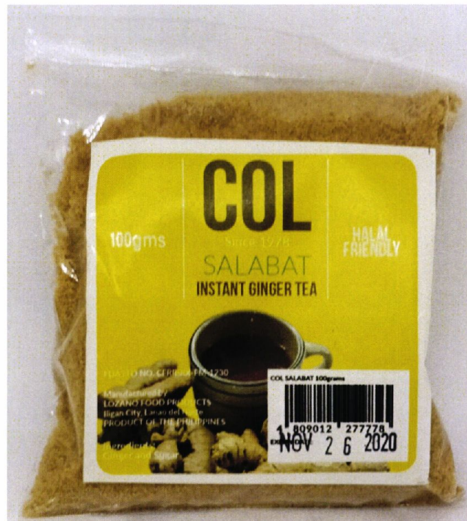
Figure 1. Unregistered COL SALABAT Instant Ginger Tea

The Food and Drug Administration (FDA) advises the public from purchasing and consuming the following unregistered food products: