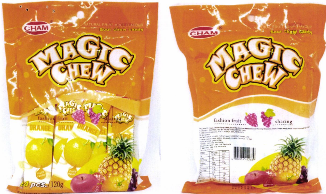
Figure 4. Unregistered CHAM MAGIC CHEW Sour Chew Candy Natural Fruit Juice Flavor - Orange