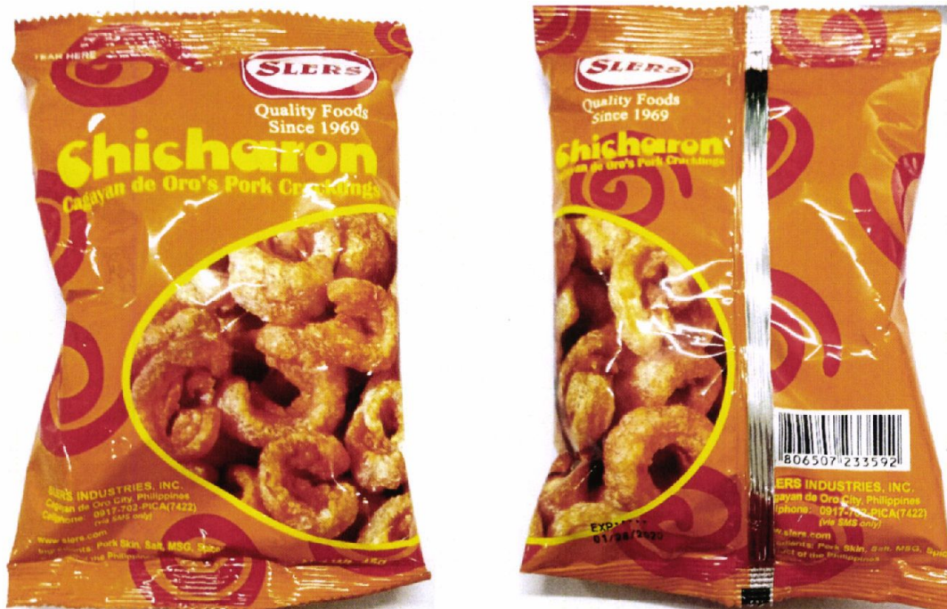
Figure 5. Unregistered SLERS Chicharon Cagayan de Oro's Pork Cracklings

The FDA verified through post-marketing surveillance that the abovementioned food products are not authorized and the Certificates of Product Registration (CPR) have not been issued. Pursuant to the Republic Act No. 9711, otherwise known as the “Food and Drug Administration Act of 2009”, the manufacture, importation, exportation, sale, offering for sale, distribution, transfer, non-consumer use, promotion, advertising or sponsorship of health products without the proper authorization is prohibited.