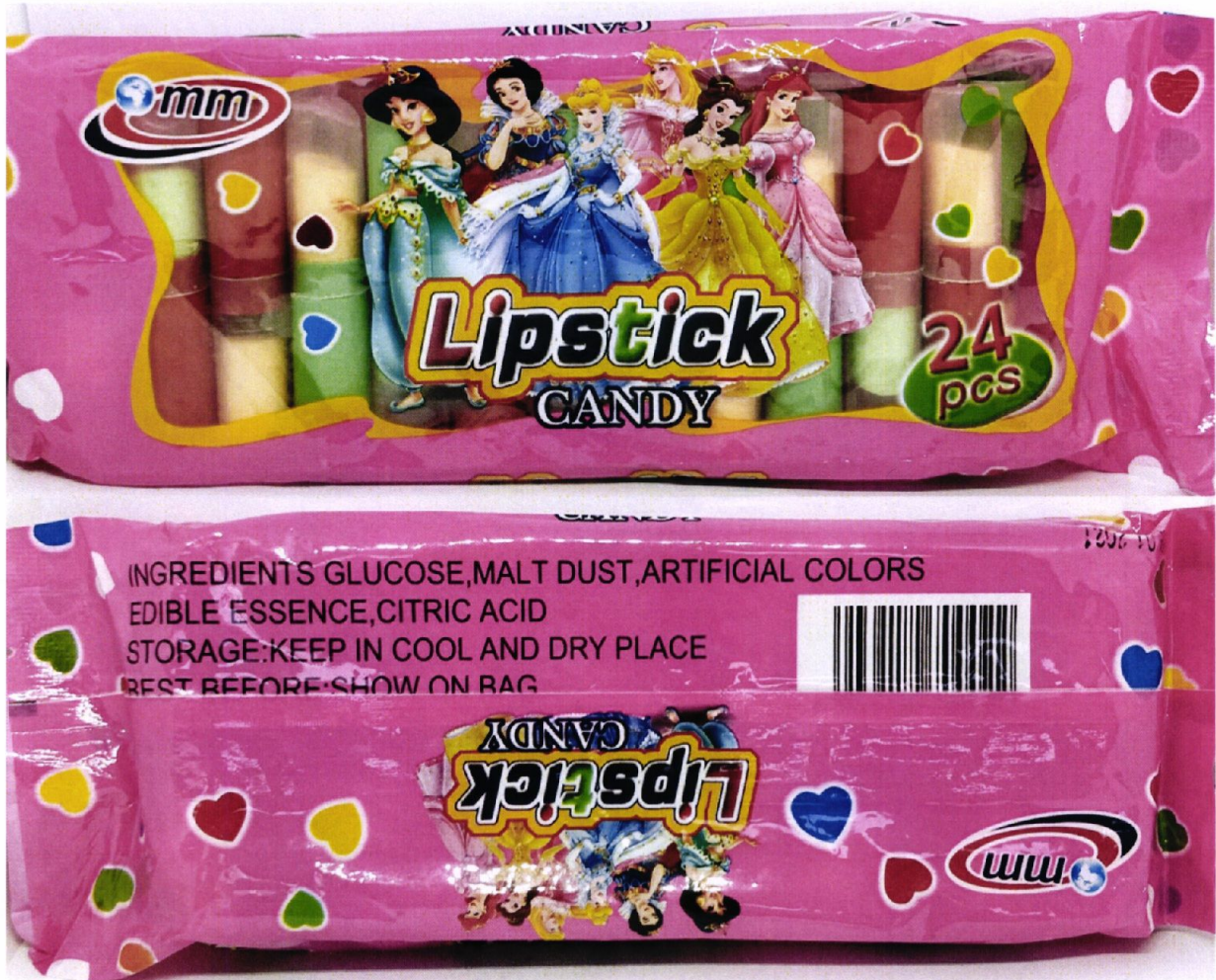
Figure 3. Unregistered MM Lipstick Candy