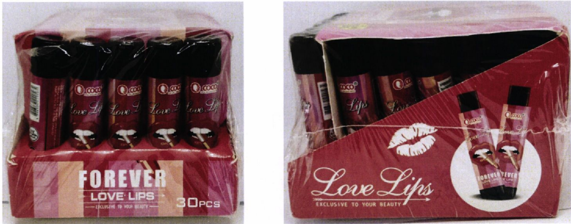
Figure 2. Unregistered COCO FALL IN LOVE Forever Love Lips