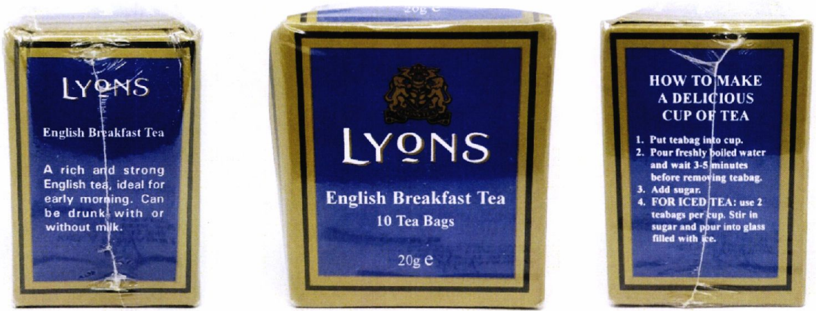
Figure 4. Unregistered LYONS English Breakfast Tea