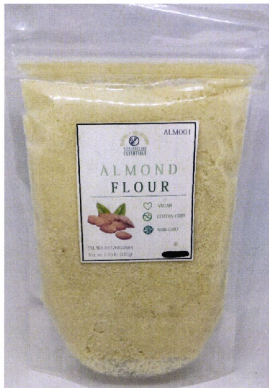
Figure 3. Unregistered CLOTHELY COLLECTIONS KETO FOODS AND ESSENTIALS Almond Flour