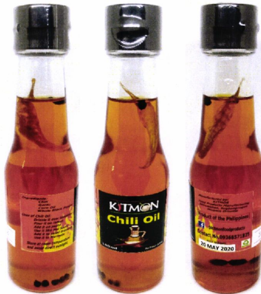
Figure 2. Unregistered KITMON Chili Oil