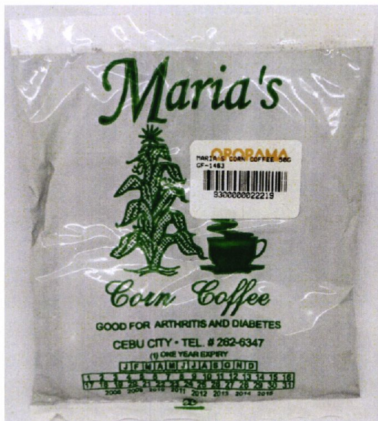
Figure 5. Unregistered MARIA'S Corn Coffee