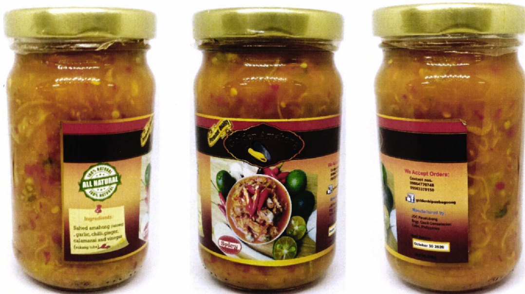
Figure 1. Unregistered GOLDEN AMAHONG Premium Quality Amahong Spicy

The Food and Drug Administration (FDA) advises the public from purchasing and consuming the following unregistered food products: