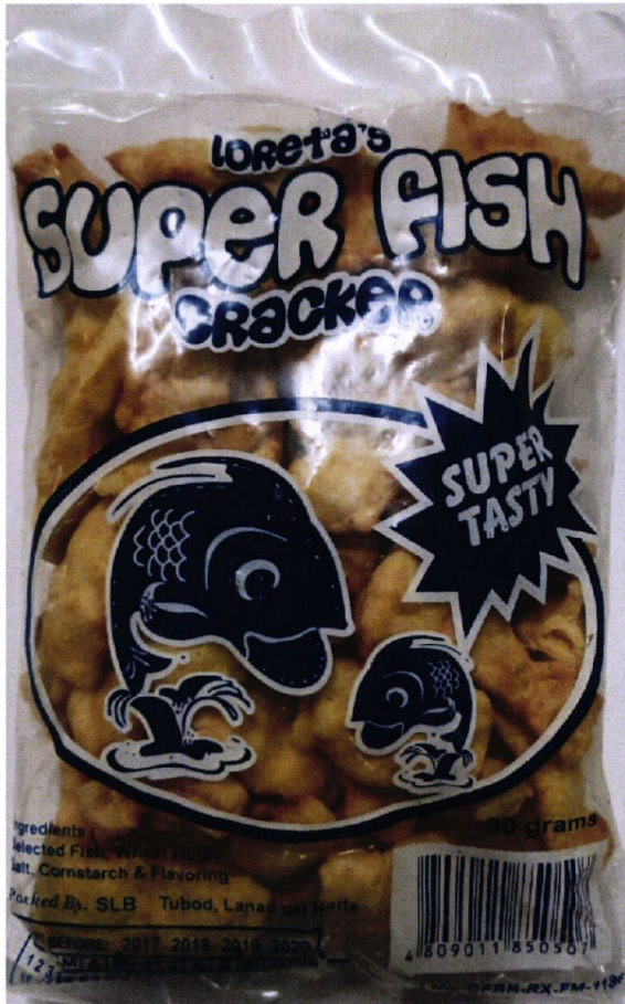
Figure 2. Unregistered LORETA'S Super Fish Cracker