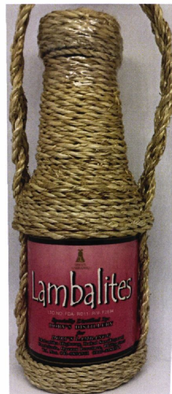
Figure 5. Unregistered DORY'S LAMBANOG Lambalite's