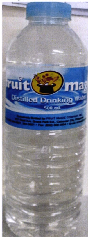
Figure 4. Unregistered FRUIT MAGIC Distilled Drinking Water