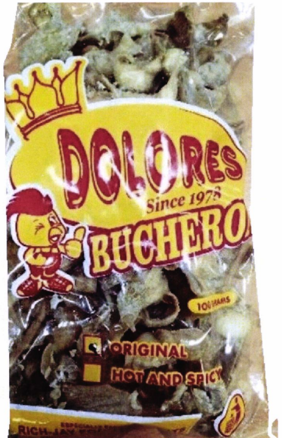
Figure 3. Unregistered DOLORES Buchero. Original