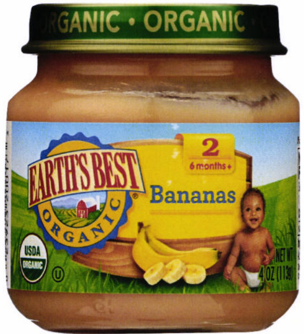
Figure 3. Unregistered EARTH'S BEST Organic Bananas