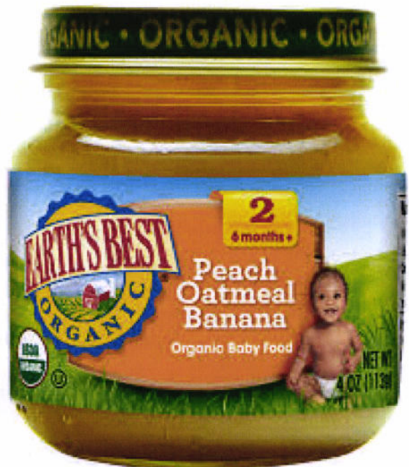
Figure 5. Unregistered EARTH'S BEST Organic Peach Oatmeal Banana