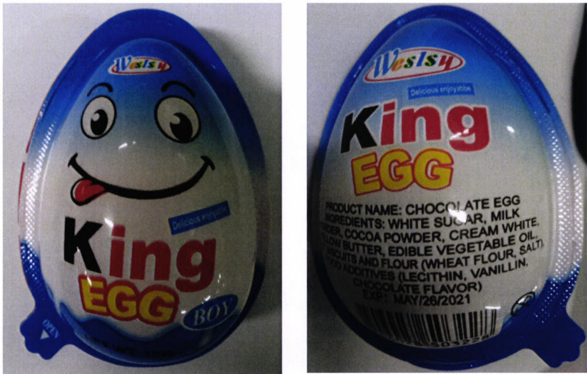
Figure 1. Unregistered WESLSY KING EGG BOY Chocolate Egg

The Food and Drug Administration (FDA) warns the public from purchasing and consuming the following unregistered food products: