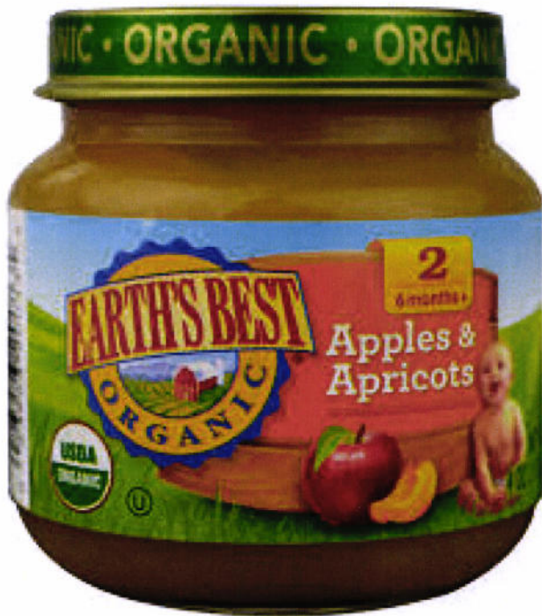
Figure 2. Unregistered EARTH'S BEST Organic Apples & Apricots