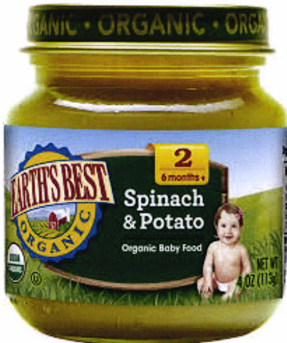
Figure 4. Unregistered EARTH'S BEST Organic Spinach & Potato