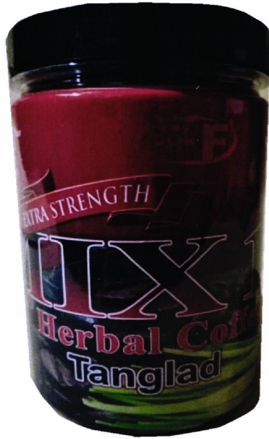
Figure 2. Unregistered DOK F EXTRA STRENGTH MIX 10 Herbal Coffee Tanglad