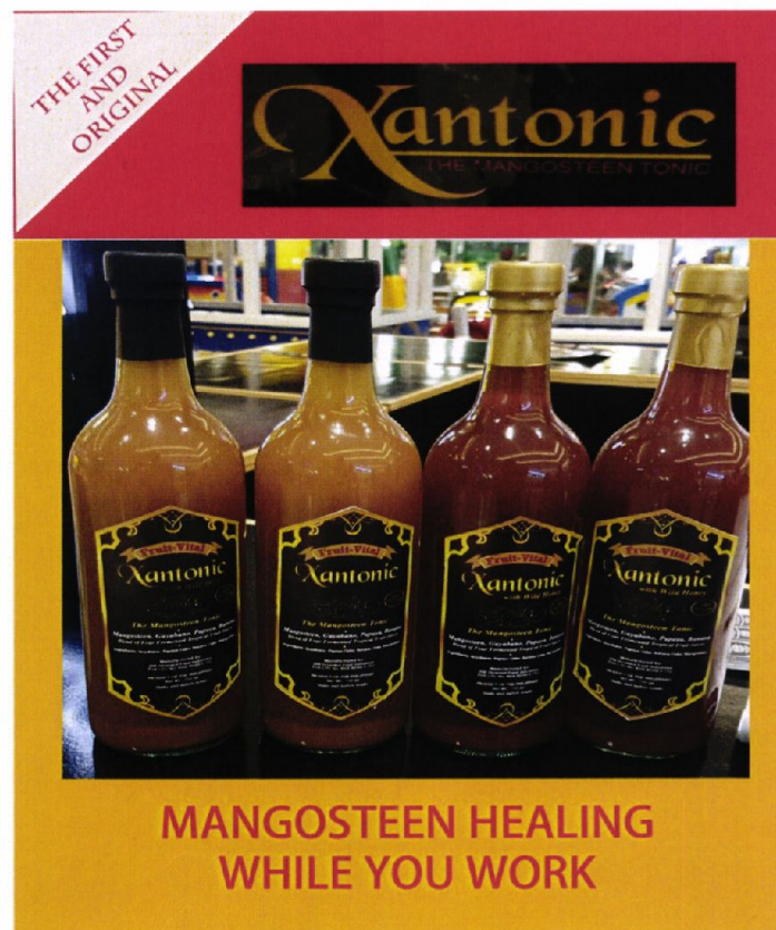
Figure 1. Unregistered FRUIT-VITAL XANTONIC The Mangosteen Tonic with Wild Honey (Source: https://shopee.ph/Xantonic-Fruit-Health-Drink-i.76564144.1551157809 )

The Food and Drug Administration (FDA) warns the public from purchasing and consuming the following food product and food supplements: