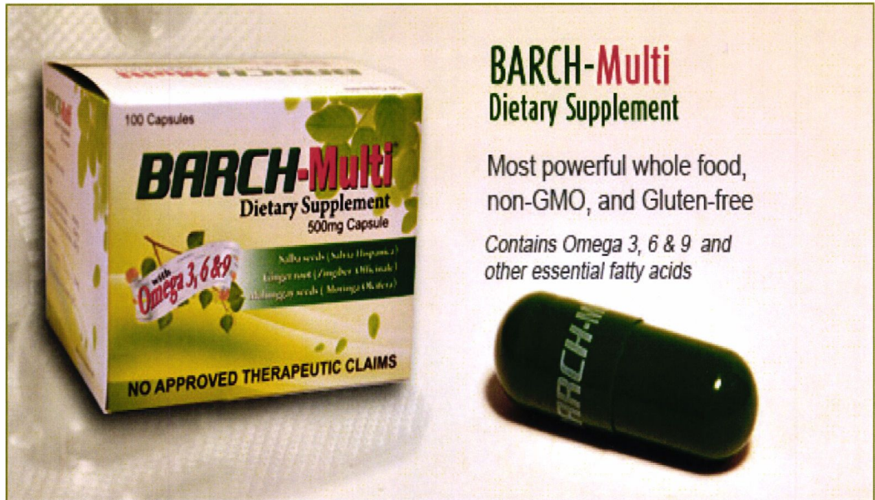
Figure 2. Unregistered BARCH-MULTI Dietary Supplement with Omega 3,6 &9, 500mg