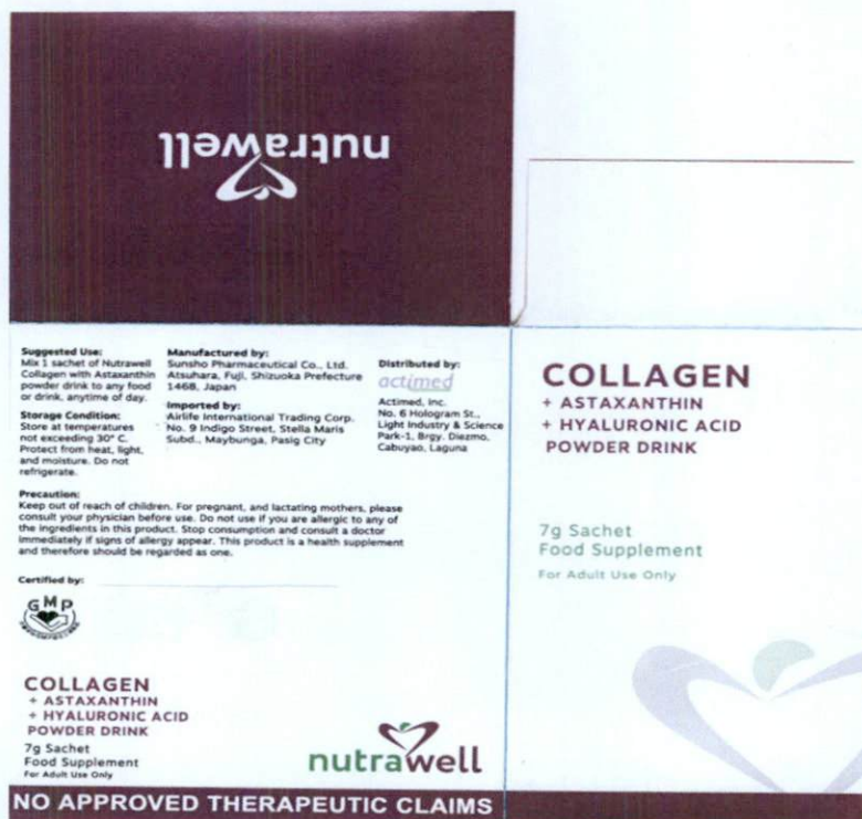
Figure 1. Approved label of NUTRAWELL Collagen with Astaxanthin and Hyaluronic Acid Food Supplement Powder, FR-4000005694301 issued on 23 April 2020 valid until 23 April 2022

The Food and Drug Administration (FDA) informs the public that the food supplement NUTRAWELL Collagen with Astaxanthin and Hyaluronic Acid Food Supplement Powder has been registered by the Market Authorization Holder (MAH) AIRLIFE INTERNATIONAL TRADING CORPORATION , in accordance to existing FDA rules and regulations.