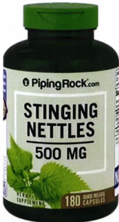
Figure 4. Unregistered PIPINGROCK.COM Stinging Nettles Herbal Supplement