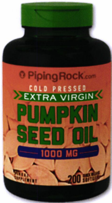
Figure 2. Unregistered PIPINGROCK.COM Cold Pressed Extra Virgin Pumpkin Seed Oil Herbal Supplement