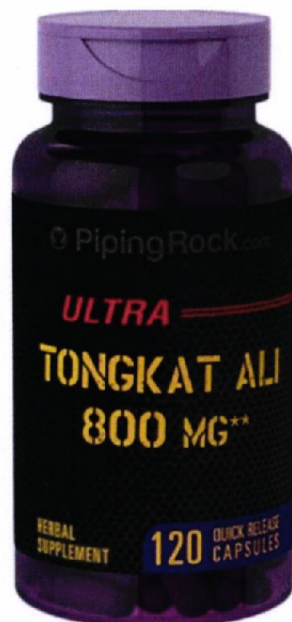
Figure 1. Unregistered PIPINGROCK.COM Ultra Tongkat Ali Herbal Supplement

The Food and Drug Administration (FDA) warns the public from purchasing and consumption of the following unregistered food supplements: