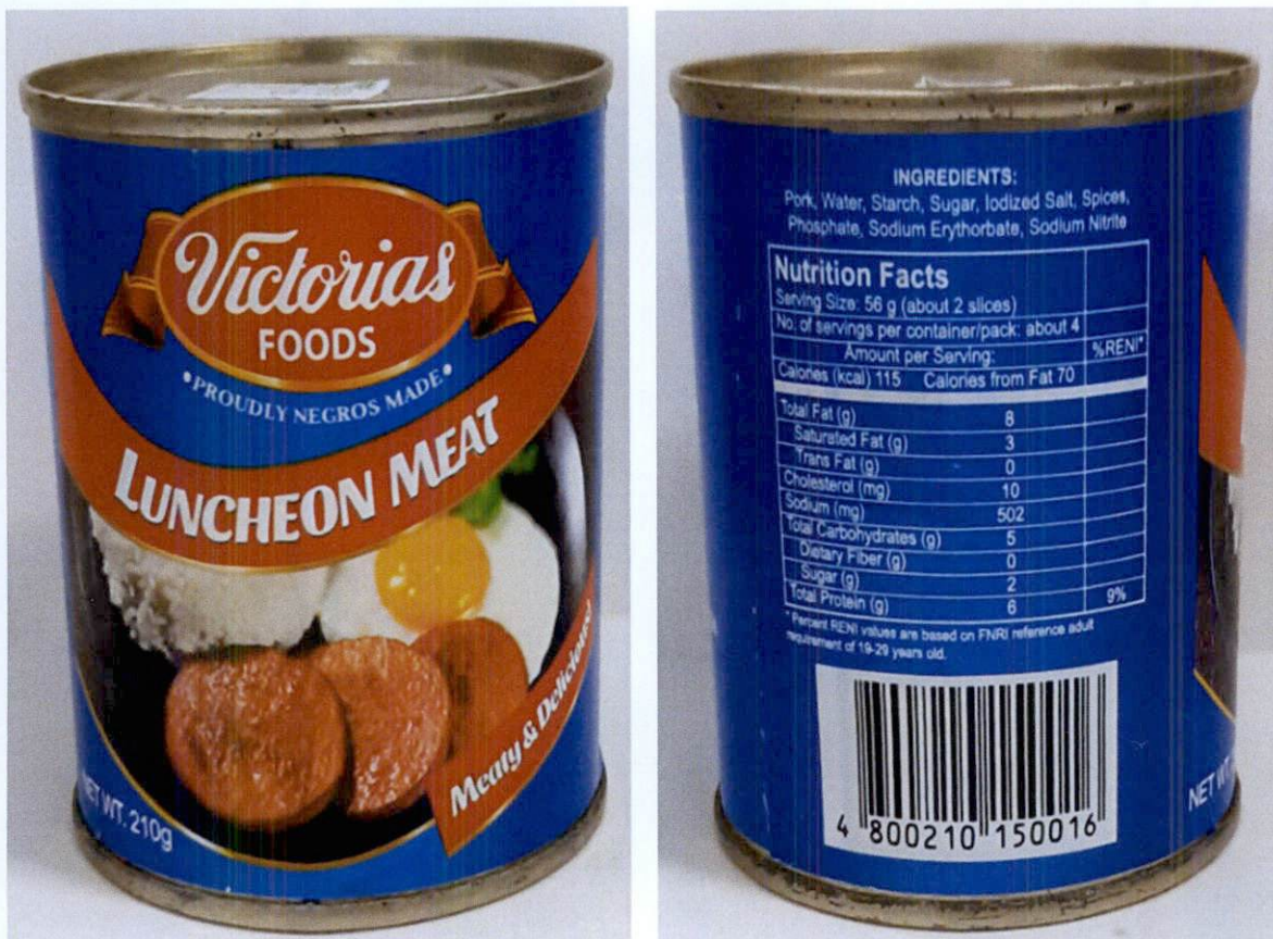
Figure 1. Registered VICTORIAS FOODS Luncheon Meat

The Food and Drug Administration (FDA) informs the public that the food product VICTORIAS FOODS Luncheon Meat is registered by the Market Authorization Holder, VICTORIAS FOODS CORPORATION , under the National Meat Inspection Service (NMIS).