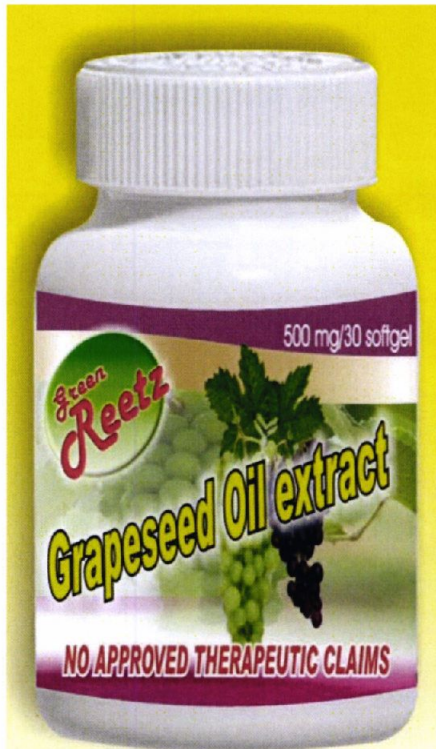
Figure 4. Unregistered GREEN REETZ Grape Seed Oil Extract, 500mg (30 Softgels)