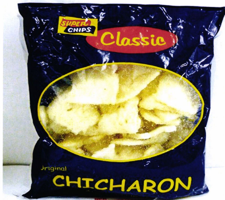
Figure 1. Unregistered SUPER CHIPS CLASSIC Original Chicharon, Net Wt. 100gms.

The Food and Drug Administration (FDA) warns the public from purchasing and consuming the following unregistered food products and food supplements: