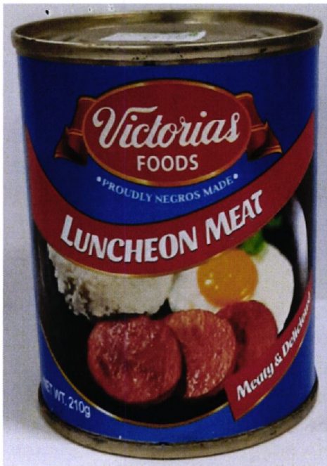
Figure 2. Unregistered VICTORIAS FOOD Luncheon Meat, Net Wt. 210g