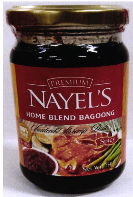
Figure 3. Unregistered NAYEL'S HOME BLEND Bagoong – Spicy, Net Wt. 250g