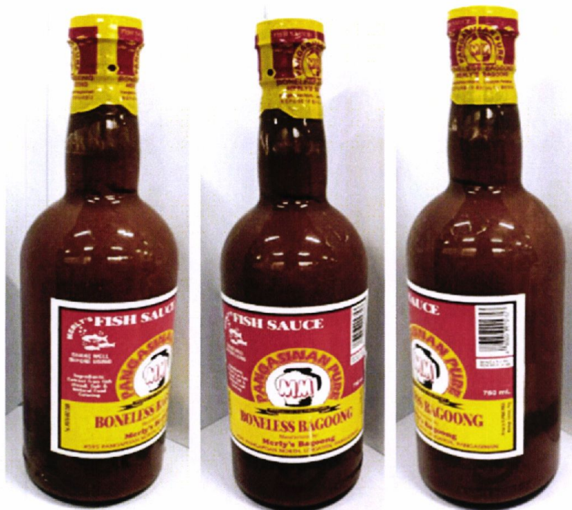
Figure 1. Unregistered MM PANGASINAN PURE Boneless Bagoong, Net Content 750ml

The Food and Drug Administration (FDA) warns the public from purchasing and consuming the following unregistered food products: