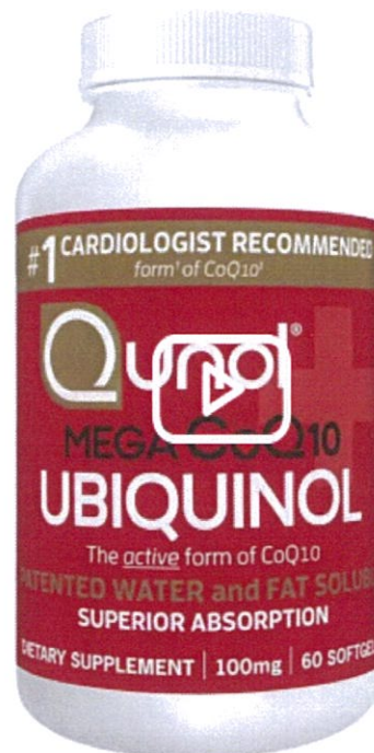
Figure 5. Unregistered QUNOL Mega CoQ10 Ubiquinol Dietary Supplement