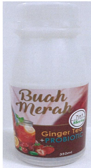
Figure 3. Unregistered BUAH MERAH Ginger Tea + Probiotic