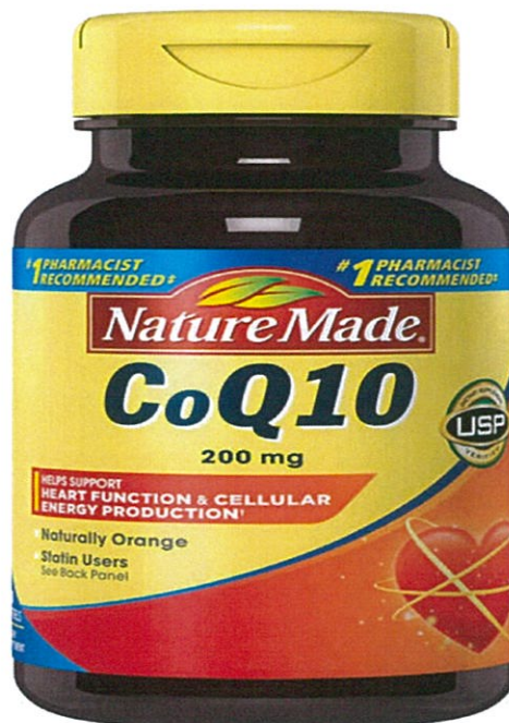
Figure 1. Unregistered NATURE MADE CoQ10, 200mg

The Food and Drug Administration (FDA) warns the public from purchasing and consuming the following unregistered food supplements: