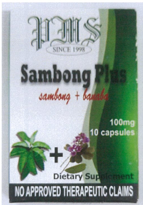
Figure 4. Unregistered PMS Sambong Plus Sambong + Banaba Dietary Supplement