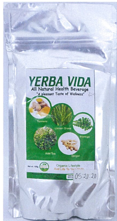
Figure 5. Unregistered YERBA VIDA All Natural Health Beverage