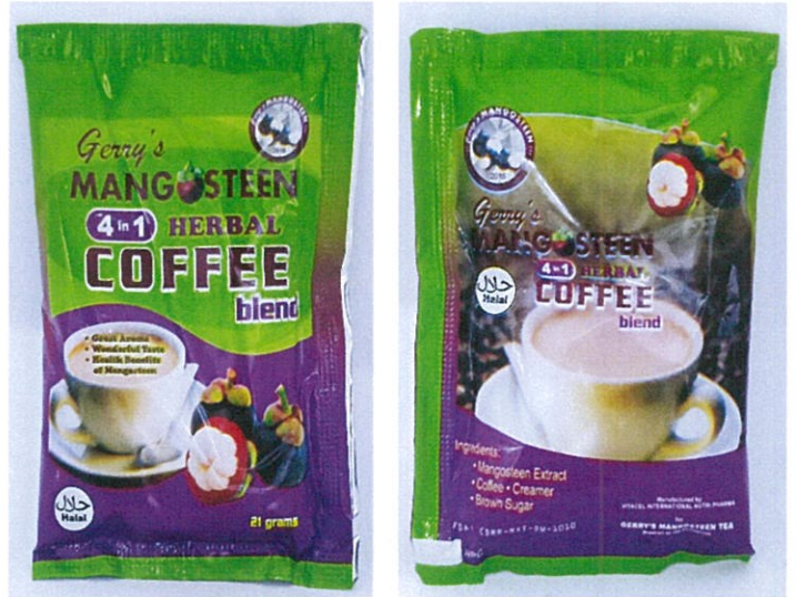
Figure 3. Unregistered GERRY'S Mangosteen 4 in 1 Herbal Coffee Blend