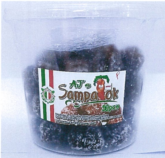
Figure 2. Unregistered AJ'S Sampalok