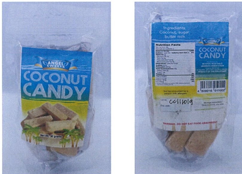
Figure 1. Unregistered ANGEL SWEETS Coconut Candy

The Food and Drug Administration (FDA) warns the public from purchasing and consumption of the following unregistered food products: