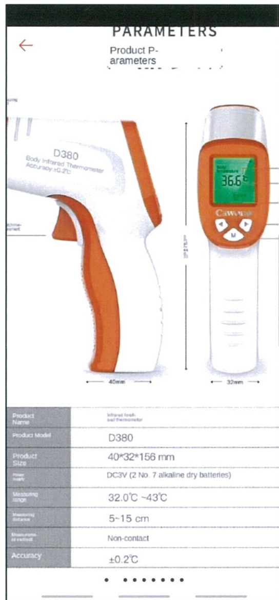
Figure 2. Unregistered Cawono® D380 Non-Contact IR Thermometer offered for sale online

The FDA verified through post-marketing surveillance that the abovementioned medical device is not registered and the Certificate of Product Registration (CPR) has not yet been issued. Pursuant to the Republic Act No. 9711, otherwise known as the “Food and Drug Administration Act of 2009”, the manufacture, importation, exportation, sale, offering for sale, distribution, transfer, non-consumer use, promotion, advertising or sponsorship of health products without the proper authorization is prohibited.