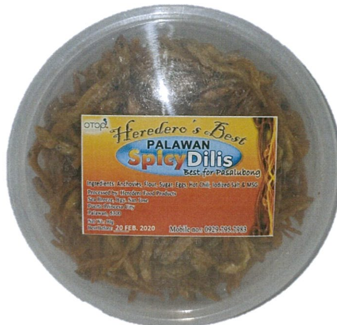
Figure 1. Unregistered HEREDERO'S BEST Palawan Spicy Dilis Best for Pabalubong

The Food and Drug Administration (FDA) warns the public from purchasing and consumption of the following unregistered food products: