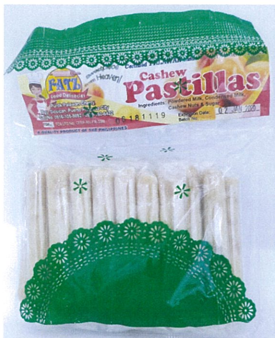
Figure 4. Unregistered FATZ FOOD DELICACIES Cashew Pastillas