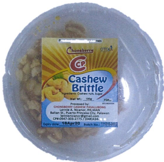
Figure 2. Unregistered CHONSBERRY CCP Cashew Brittle