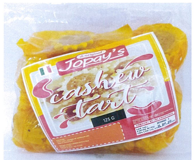
Figure 5. Unregistered D-ORIGINAL JOPAY'S Cashew Tart