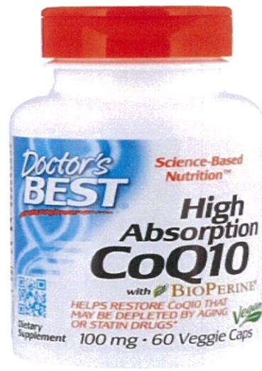
Figure 3. Unregistered DOCTOR'S BEST SCIENCE BASED NUTRITION High Absorption CoQ10 with Bioperine Dietary Supplement 100mg, 60 Veggie Caps