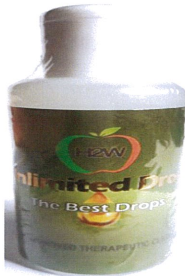
Figure 4. Unregistered H2W UNLIMITED DROPS The Best Drops, 60ml