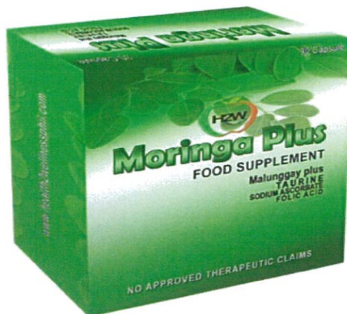
Figure 5. Unregistered H2W Moringa Plus, 30 Capsules