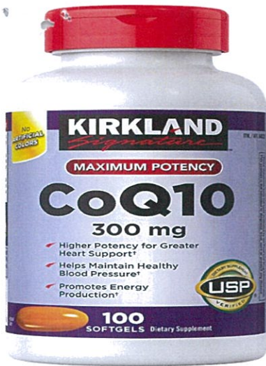
Figure 2. Unregistered KIRKLAND SIGNATURE CoQ10 300mg, 100 Softgels Dietary Supplement