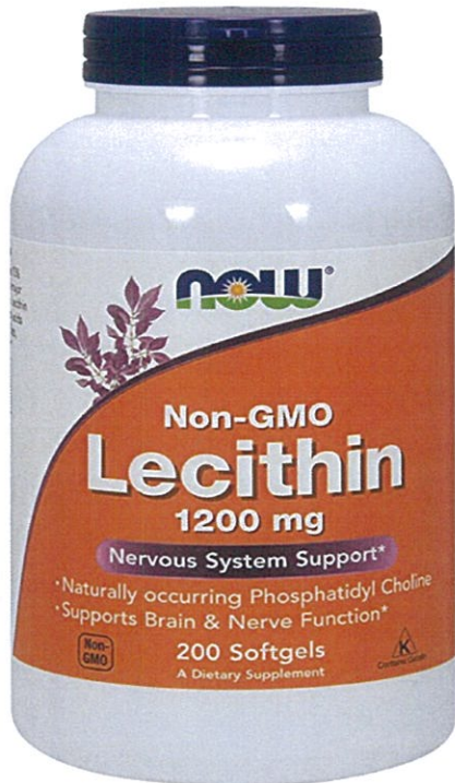
Figure 4. Unregistered NOW Non-GMO Lecithin 1200mg Dietary Supplement