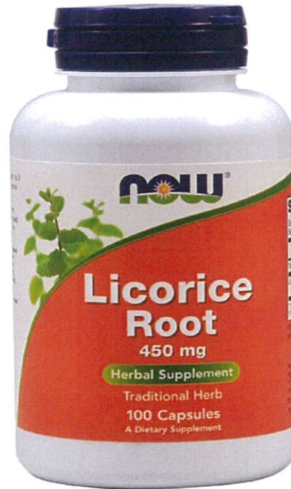
Figure 3. Unregistered NOW Licorice Root 450mg Herbal Supplement