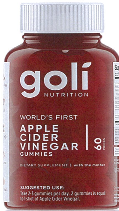
Figure 5. Unregistered GOLI Apple Cider Vinegar Gummies Dietary Supplement