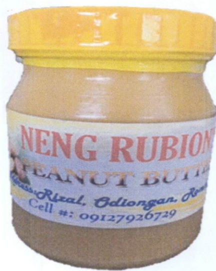
Figure 5. Unregistered NENG RUBION'S Creamy Peanut Butter