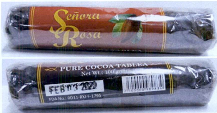
Figure 2. Unregistered SEÑORA ROSA Pure Cocoa Tablea, Net Wt. 100 grams