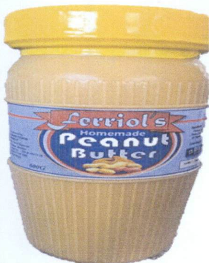
Figure 4. Unregistered FERRIOL'S Homemade Peanut Butter, 600g