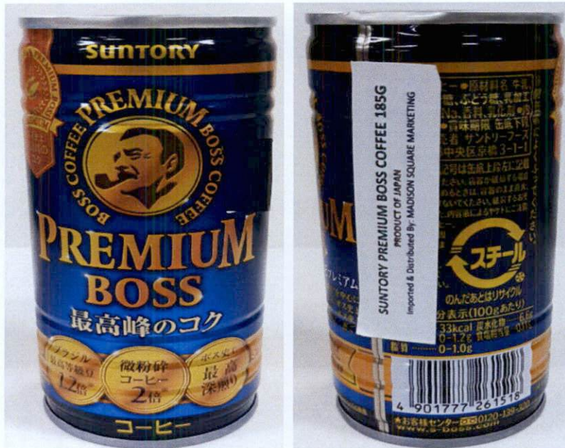
Figure 3. Unregistered SUNTORY Premium Boss Coffee, 185g