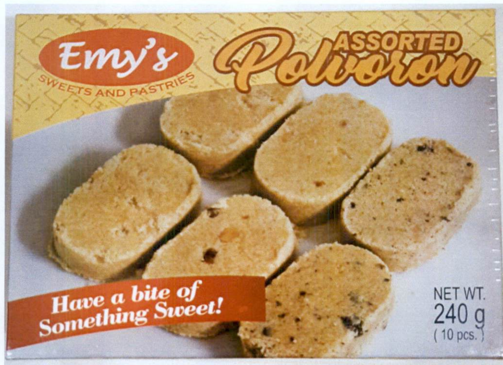
Figure 1. Unregistered EMY'S SWEETS AND PASTRIES Assorted Polvoron, Net Wt. 240g (10pcs)

The Food and Drug Administration (FDA) warns the public from purchasing and consuming the following unregistered food products: