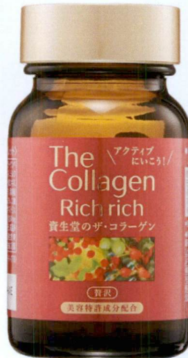
Figure 5. Unregistered The Collagen Rich Rich Tablet