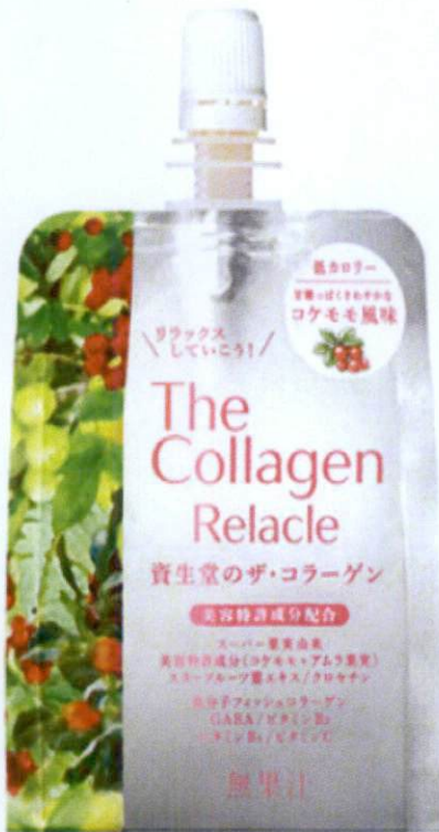
Figure 4. Unregistered The Collagen Relace Jelly