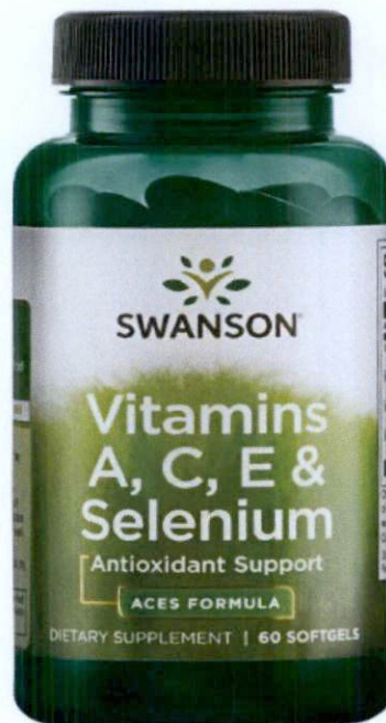
Figure 1. Unregistered SWANSON Vitamins A, C, E & Selenium Antioxidant Support Dietary Supplement

The Food and Drug Administration (FDA) advises the public from purchasing and consuming the following unregistered food supplements: