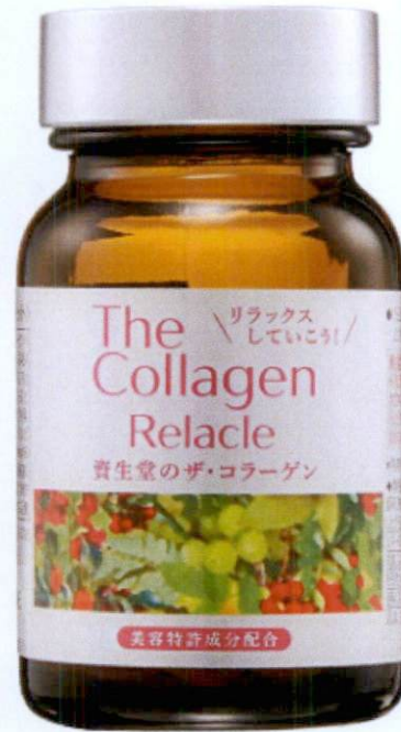
Figure 3. Unregistered The Collagen Relace Tablet