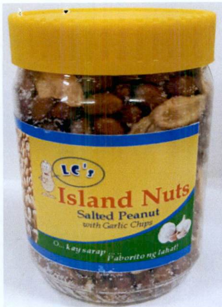
Figure 2. Unregistered LC's ISLAND NUTS Salted Peanut with Garlic Chips