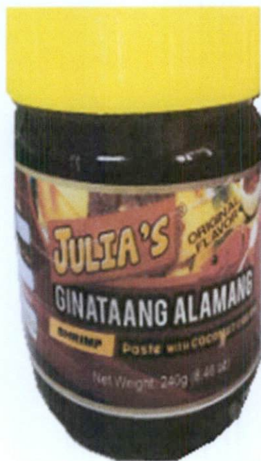
Figure 1. Unregistered JULIA'S Ginataang Alamang Shrimp Paste with Coconut Cream – Original Flavor, Net Wt. 240g (8.46oz)

The Food and Drug Administration (FDA) warns the public from purchasing and consuming the following unregistered food products: