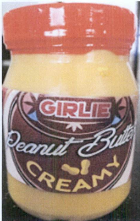
Figure 4. Unregistered GIRLIE Peanut Butter Creamy