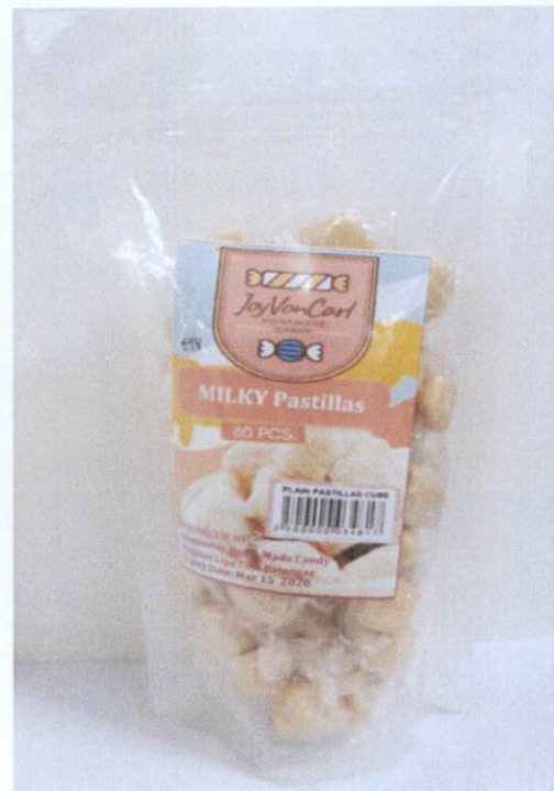
Figure 5. Unregistered JOYVONCARL HOMEMADE CANDY Milky Pastillas -Plain, 60pcs