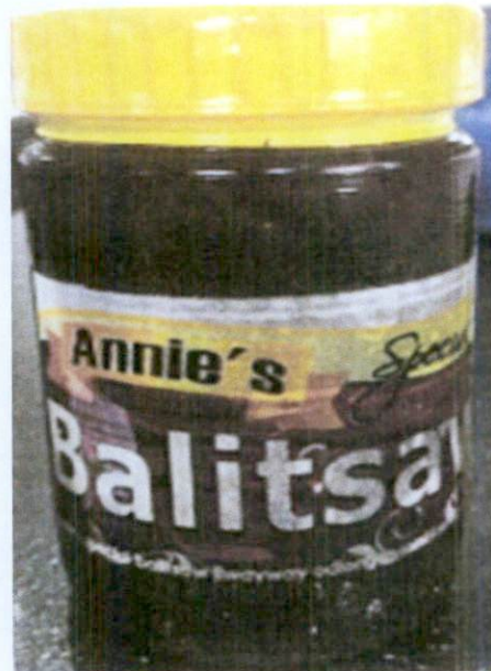
Figure 3. Unregistered ANNIE'S Special Balitsaw