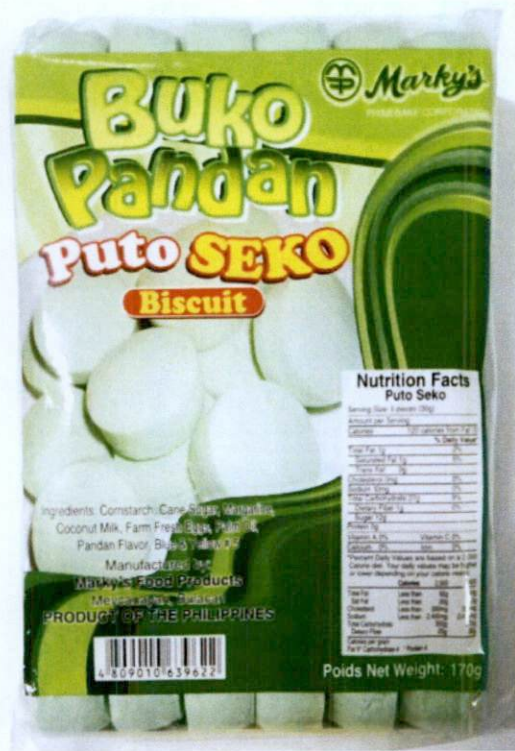
Figure 3. Unregistered MARKY'S PRIMEBAKE Buko Pandan Puto Seko Biscuit, Net Wt. 170g