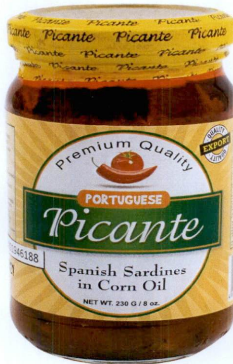
Figure 5. Unregistered PICANTE Portuguese Spanish Sardines in Corn Oil, Net Wt. 230g / 8oz

The FDA verified through post-marketing surveillance that the above mentioned food products are not authorized and the Certificates of Product Registration have not been issued. Pursuant