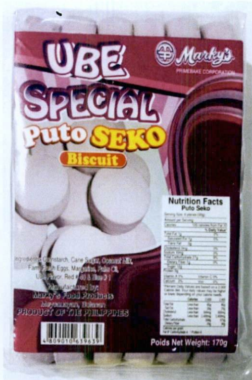
Figure 2. Unregistered MARKY'S PRIMEBAKE Ube Special Puto Seko Biscuit, Net Wt. 170g