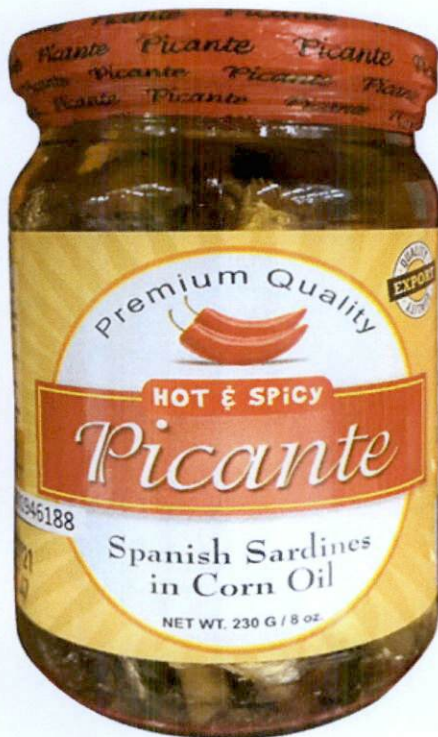
Figure 4. Unregistered PICANTE Hot & Spicy Spanish Sardines in Corn Oil, Net Wt. 230g / 8oz