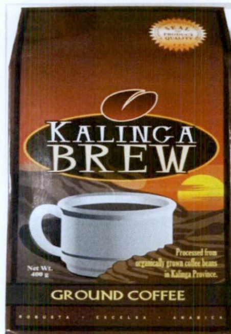
Figure 1. Unregistered KALINGA BREW Ground Coffee, 400g

The Food and Drug Administration (FDA) warns the public from purchasing and consuming the following unregistered food products: