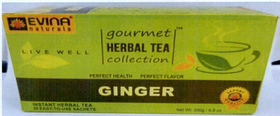
Figure 3. Unregistered EVINA NATURALS Gourmet Herbal Tea Collection Ginger