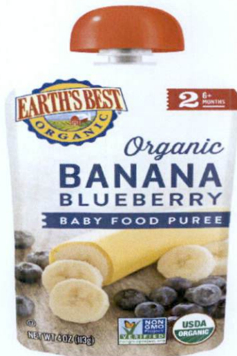
Figure 2. Unregistered EARTH'S BEST Organic Banana Blueberry Baby Food Puree