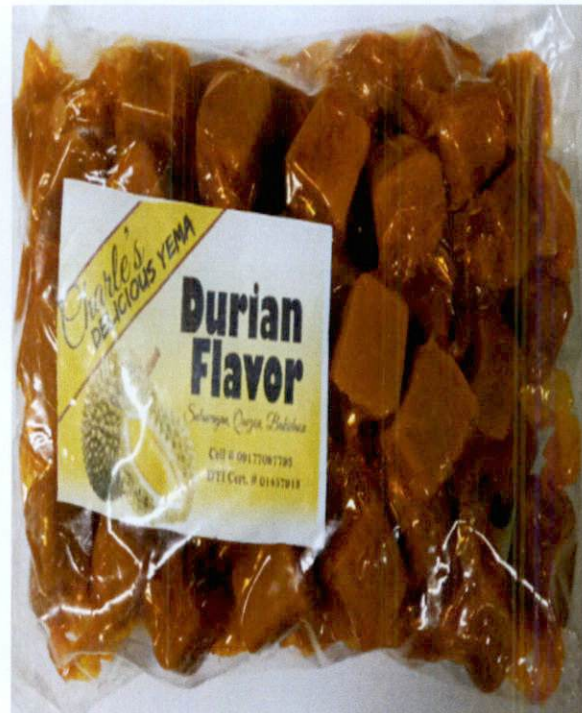
Figure 5. Unregistered CHARLE'S DELICIOUS YEMA Durian Flavor