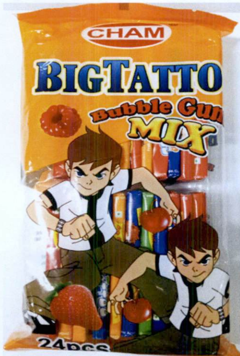
Figure 4. Unregistered CHAM BigTatto Bubble Gum Mix, 24pcs