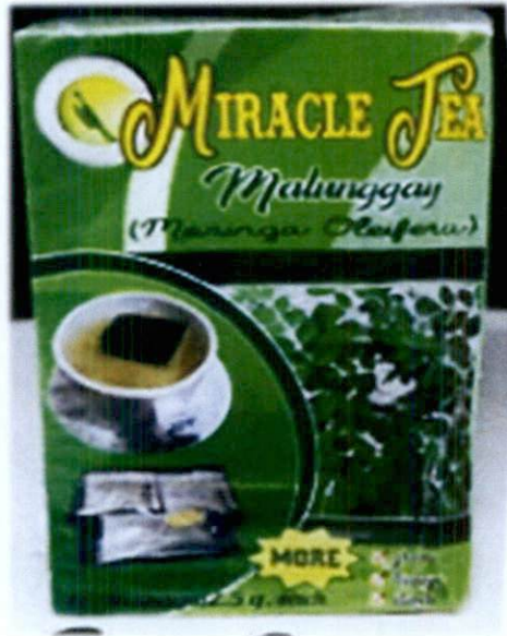
Figure 2. Unregistered MIRACLE TEA Malunggay (Moringa Oleifera) Tea