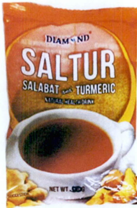
Figure 4. Unregistered DIAMOND SALTUR Salabat and Turmeric Natural Health Drink