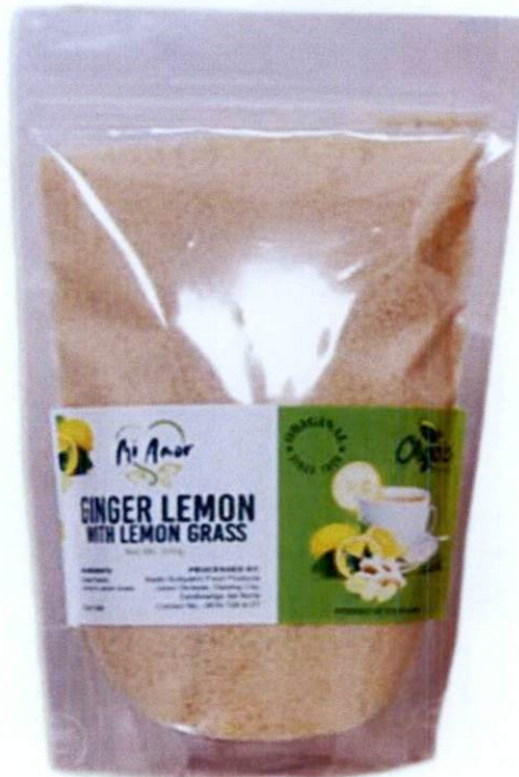
Figure 1. Unregistered MI AMOR Ginger Lemon with Lemon Grass Powder

The Food and Drug Administration (FDA) advises the public from purchasing and consuming the following unregistered food products: