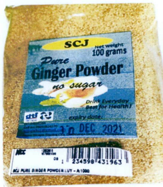
Figure 3. Unregistered SCJ Pure Ginger Powder No Sugar