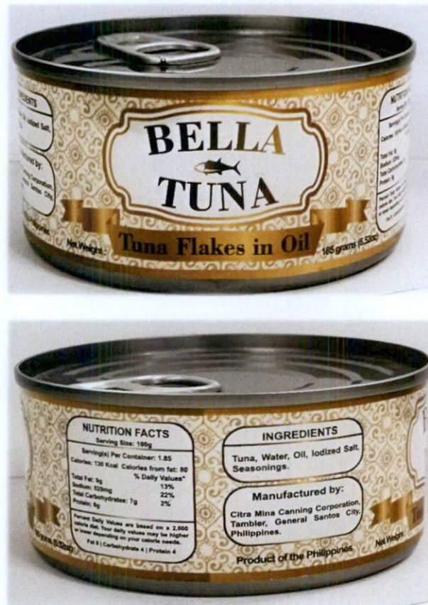
Figure 1. Unregistered BELLA TUNA Tuna Flakes in Oil

The Food and Drug Administration (FDA) advises the public from purchasing and consuming the following unregistered food products: