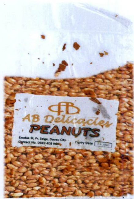
Figure 3. Unregistered AB DELICACIES Peanut