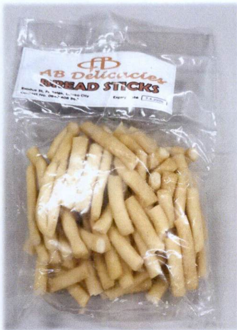
Figure 4. Unregistered AB DELICACIES BreadSticks