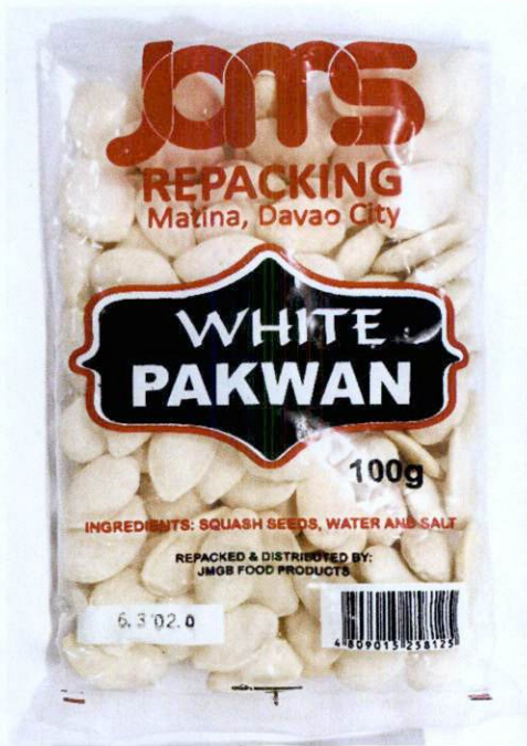
Figure 2. Unregistered JAMS REPACKING White Pakwan