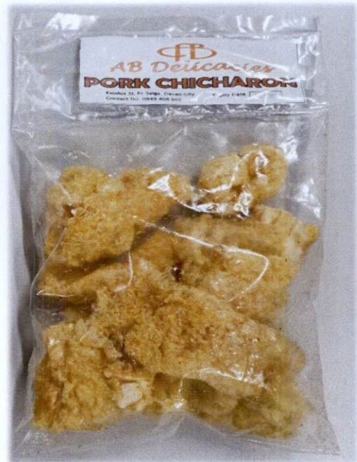
Figure 5. Unregistered AB DELICACIES Pork Chicharon