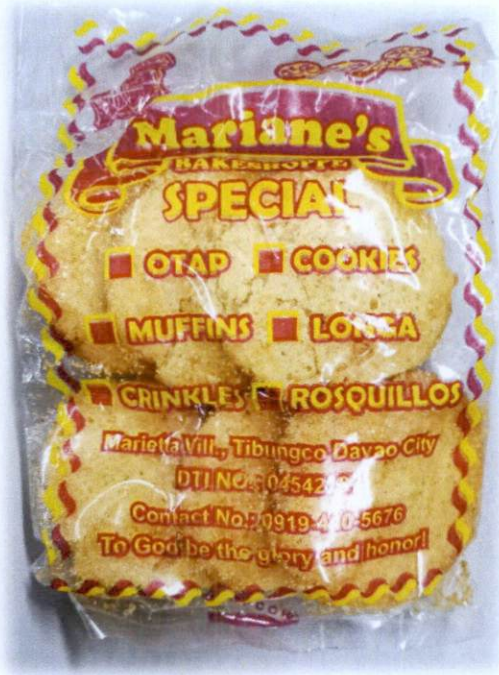
Figure 2. Unregistered MARIANNE'S BAKESHOP SPECIAL Muffins