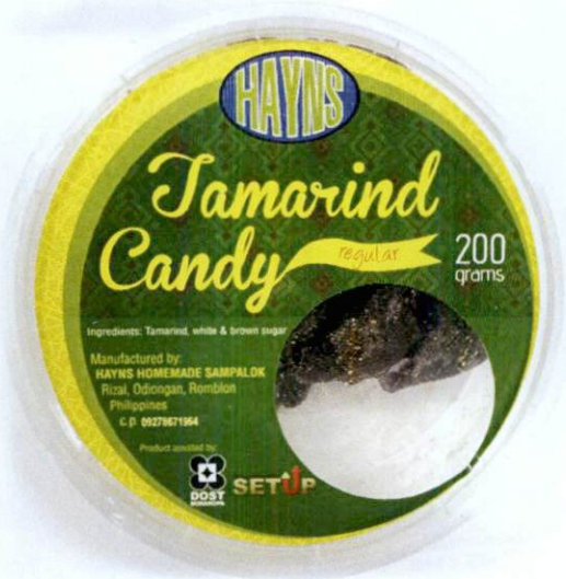
Figure 4. Unregistered HAYNS Tamarind Candy-Regular