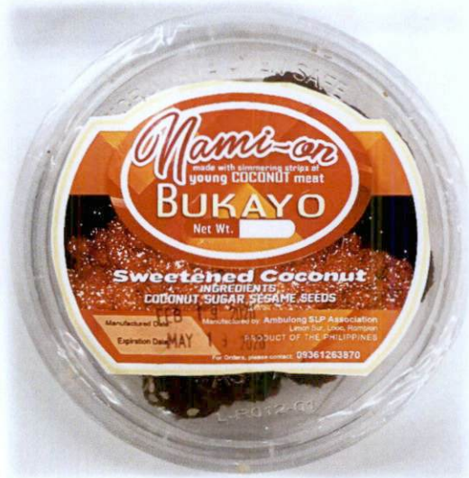
Figure 5. Unregistered NAMI-ON Bukayo Sweetened Coconut