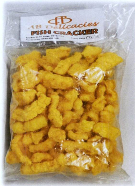
Figure 1. Unregistered AB DELICACIES Fish Cracker

The Food and Drug Administration (FDA) advises the public from purchasing and consuming the following unregistered food products: