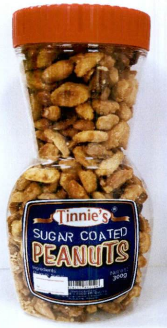
Figure 3. Unregistered TINNIE'S Sugar Coated Peanuts