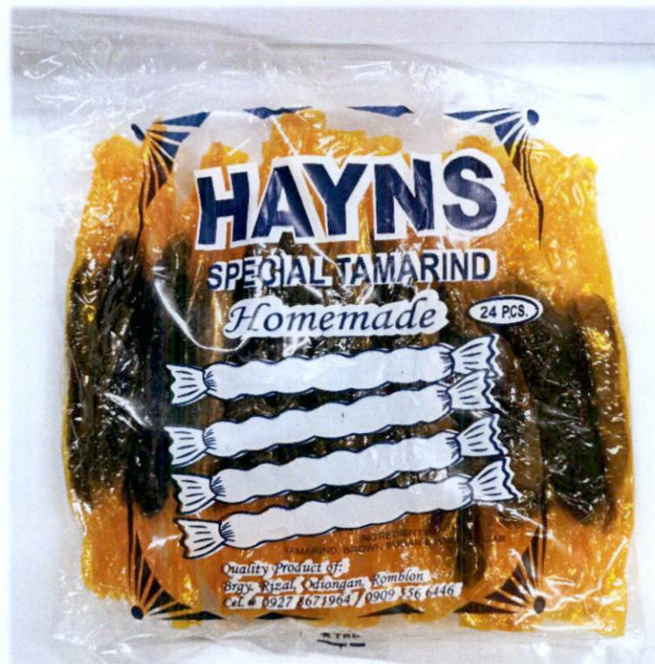
Figure 1. Unregistered HAYNS Homemade Special Tamarind

The Food and Drug Administration (FDA) advises the public from purchasing and consuming the following unregistered food products: