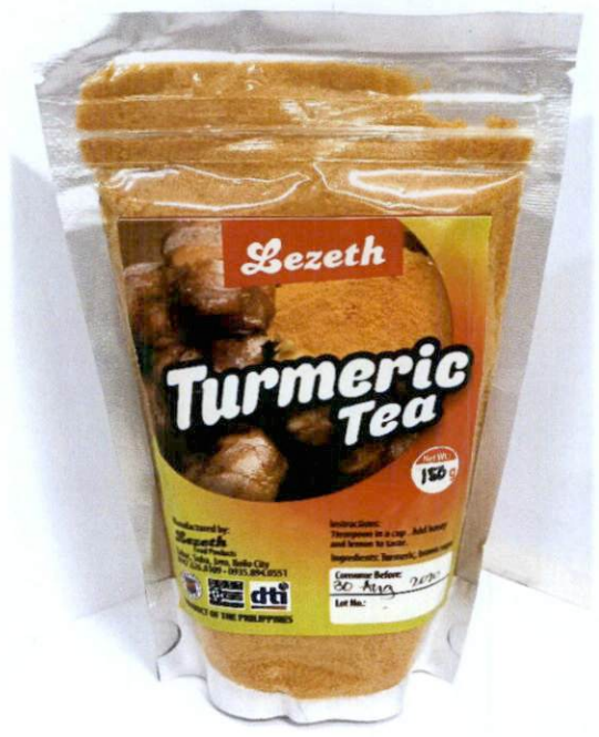
Figure 3. Unregistered LEZETH Turmeric Tea