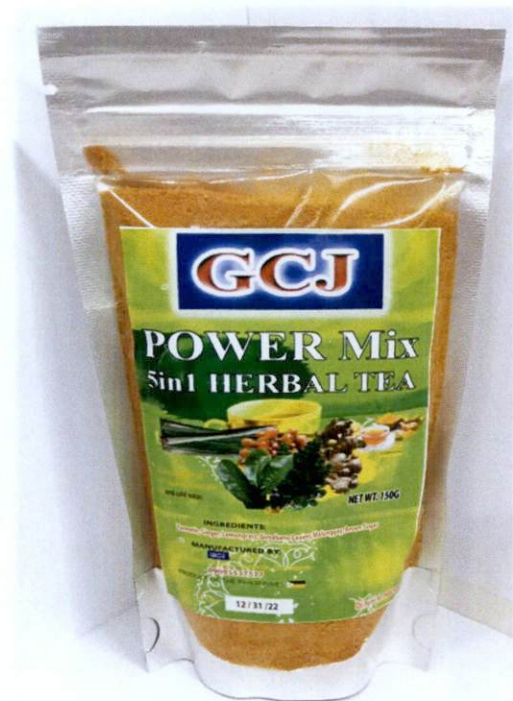
Figure 4. Unregistered GGCJ POWER MIX 5 in 1 Herbal Tea