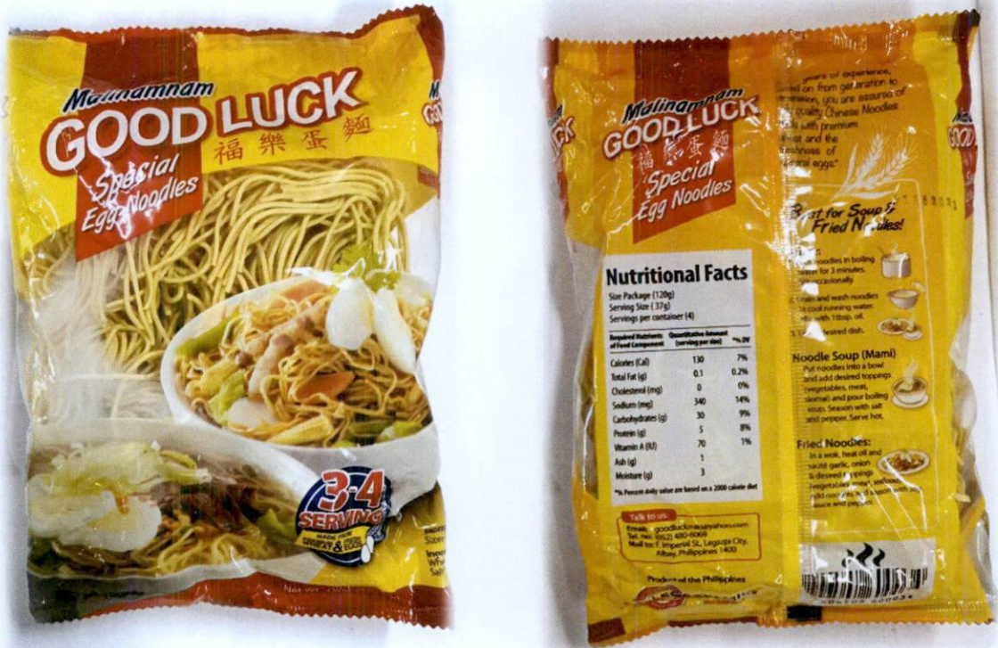
Figure 2. Unregistered GOOD LUCK Special Egg Noodles