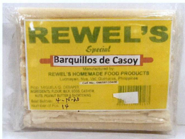
Figure 5. Unregistered REWEL'S Special Barquillos de Casoy

The FDA verified through post-marketing surveillance that the abovementioned food products are not authorized and the Certificates of Product Registration (CPR) have not been issued. Pursuant to the Republic Act No. 9711, otherwise known as the “Food and Drug Administration Act of 2009”, the manufacture, importation, exportation, sale, offering for sale, distribution,