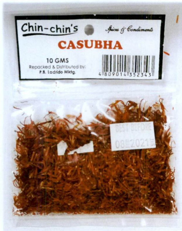
Figure 2. Unregistered CHIN-CHIN'S Casubha