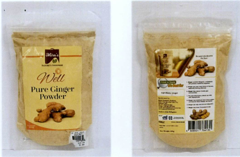
Figure 4. Unregistered MIRA'S NATURE'S GOODNESS WELL Pure Ginger Powder