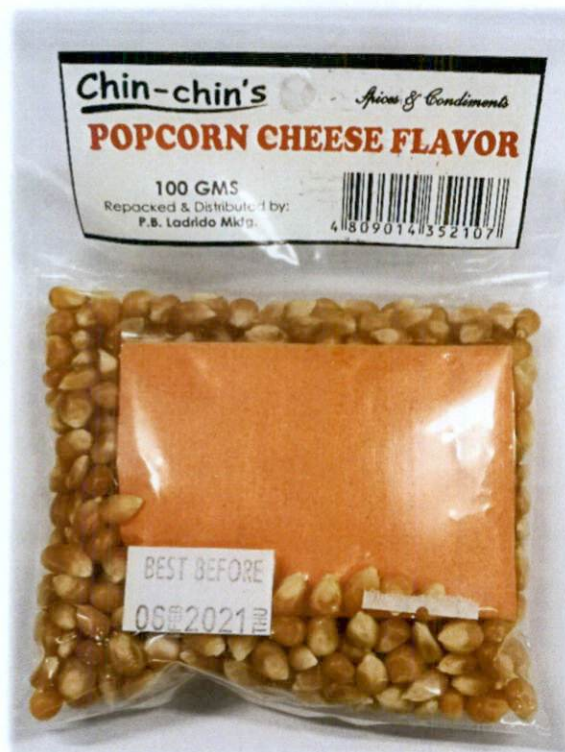
Figure 3. Unregistered CHIN-CHIN'S Popcorn Cheese Flavor