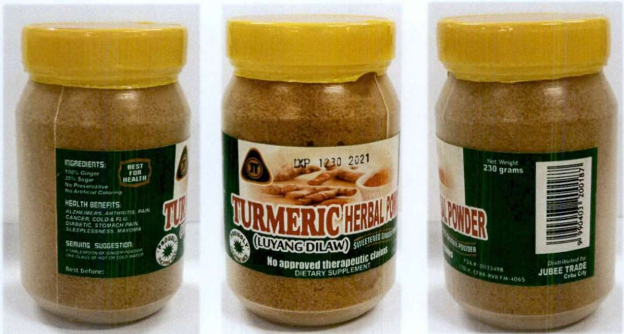
Figure 5. Unregistered JT Turmeric Herbal Powder (Luyang Dilaw) Sweetened Ginger Powder