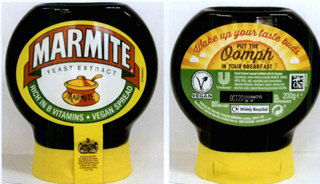
Figure 1. Unregistered MARMITE Yeast Extract

The Food and Drug Administration (FDA) advises the public from purchasing and consuming the following unregistered food products: