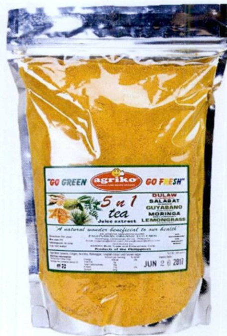
Figure 5. Unregistered AGRIKO 5 in 1 Tea Juice Extract