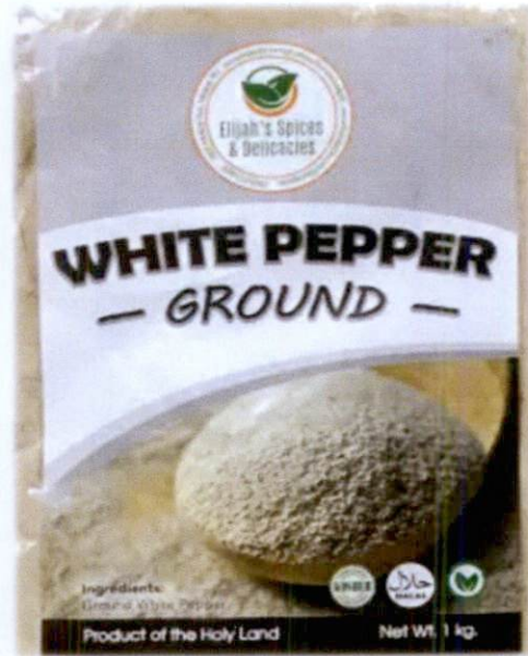
Figure 3. Unregistered ELIJAH'S SPICES White Pepper Ground