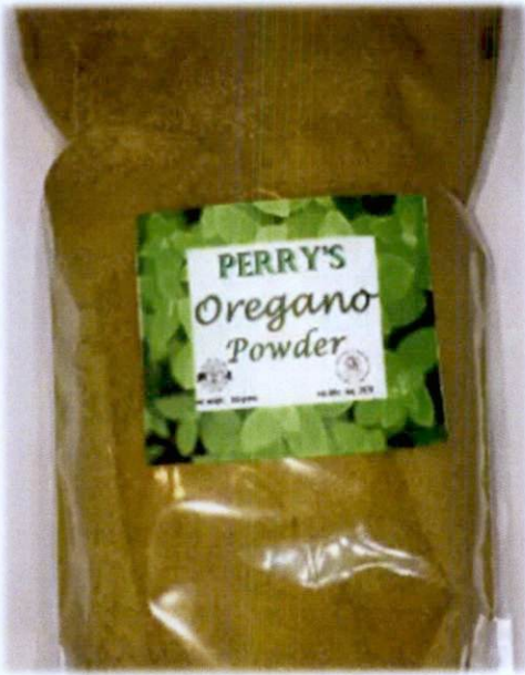
Figure 2. Unregistered PERRY'S Oregano Powder