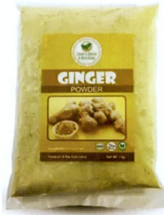
Figure 1. Unregistered ELIJAH'S SPICES Ginger Powder

The Food and Drug Administration (FDA) advises the public from purchasing and consuming the following unregistered food products: