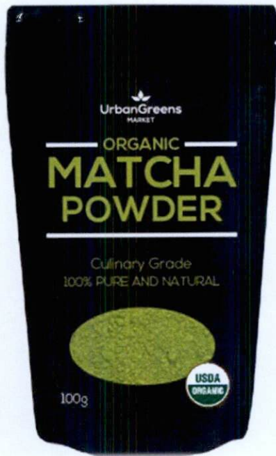
Figure 2. Unregistered URBAN GREENS Organic Matcha Powder