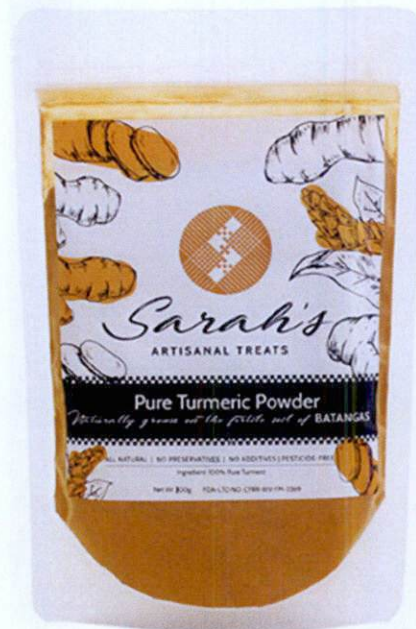
Figure 3. Unregistered SARAH'S ARTISANAL TREATS Pure Turmeric Powder