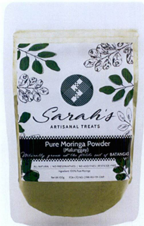
Figure 1. Unregistered SARAH'S ARTISANAL TREATS Pure Moringga (Malunggay) Powder

The Food and Drug Administration (FDA) advises the public from purchasing and consuming the following unregistered food products: