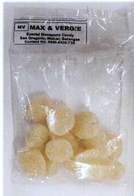
Figure 1. Unregistered MV Max & Vergie Special Macapuno Candy

The Food and Drug Administration (FDA) advises the public from purchasing and consuming the following unregistered food products: