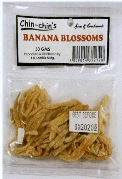
Figure 5. Unregistered CHIN-CHIN'S Banana Blossoms