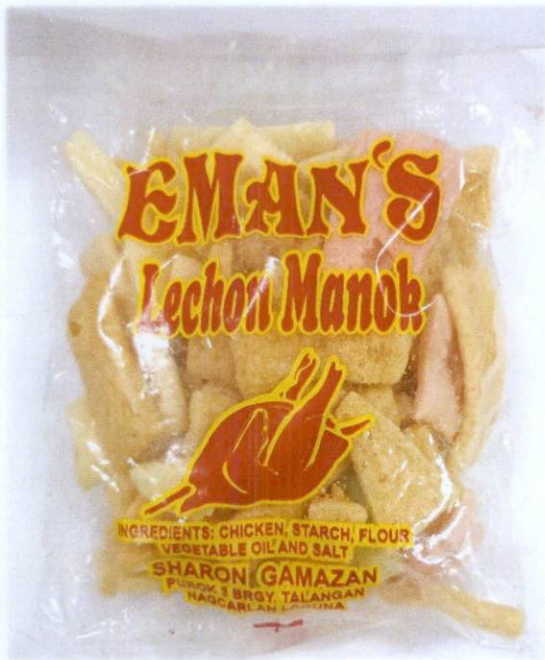
Figure 2. Unregistered EMAN'S Lechon Manok