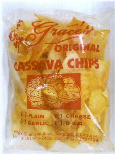
Figure 3. Unregistered GRACE'S Original Cassava Chips