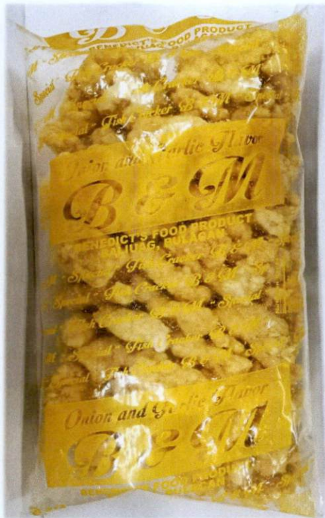
Figure 4. Unregistered B&M Fish Cracker Onion & Garlic Flavor