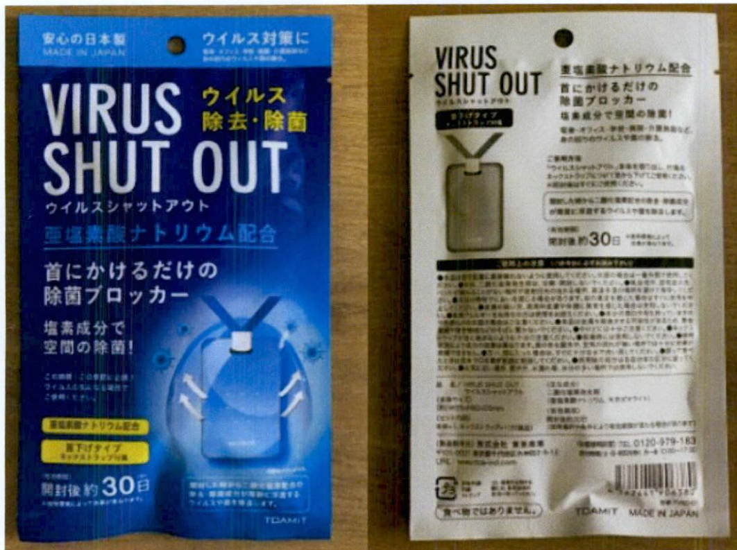
Figure 2. Virus Shut Out

The public is hereby advised to be vigilant against such deceptive marketing and promotion of disinfectants/biocides. These products shall not, in any way, cure and specially kill viruses and bacteria and any other disease, and should not bear any misleading, deceptive and false claims on their labels and/or any promotional materials that will provide erroneous impression on the product's character or identity.