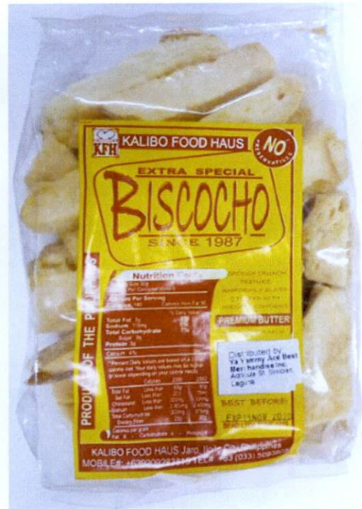
Figure 3. Unregistered KALIBO FOOD HAUS Extra Special Biscocho