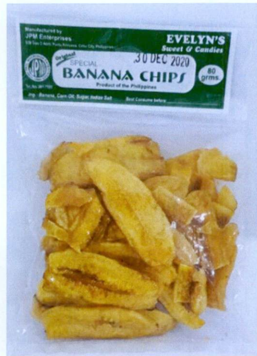
Figure 5. Unregistered EVELYN'S SWEET & CANDIES Original Special Banana Chips, 80gms.