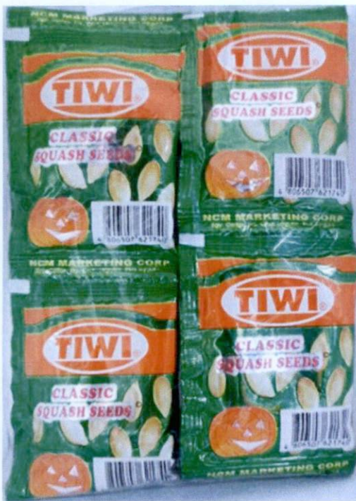
Figure 4. Unregistered TIWI Classic Squash Seeds