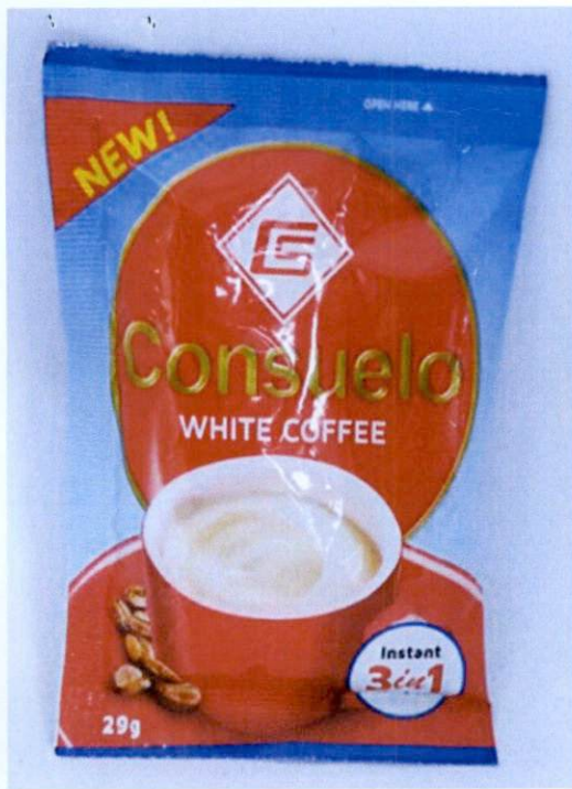
Figure 2. Unregistered CONSUELO White Instant Coffee 3in1, Net Wt. 29g