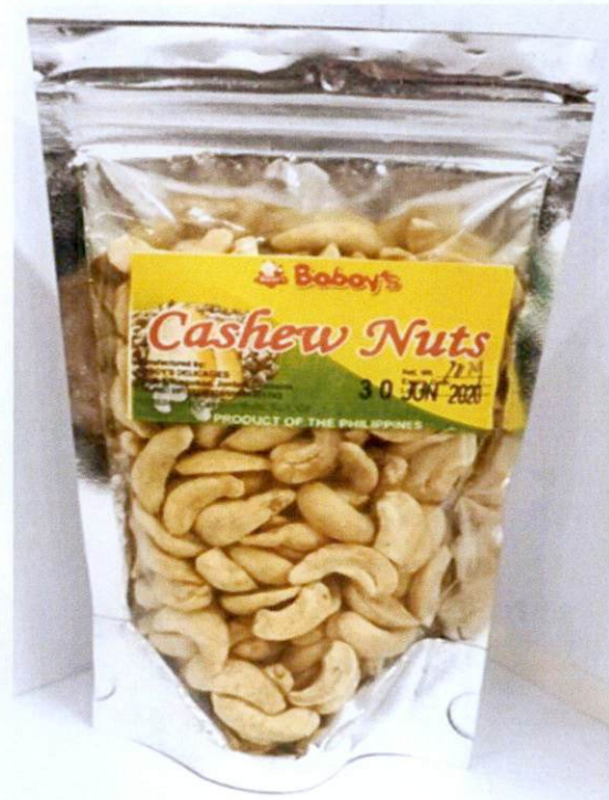
Figure 5. Unregistered BOBOY'S DELICACIES Cashew Nuts, Net Wt. 100g