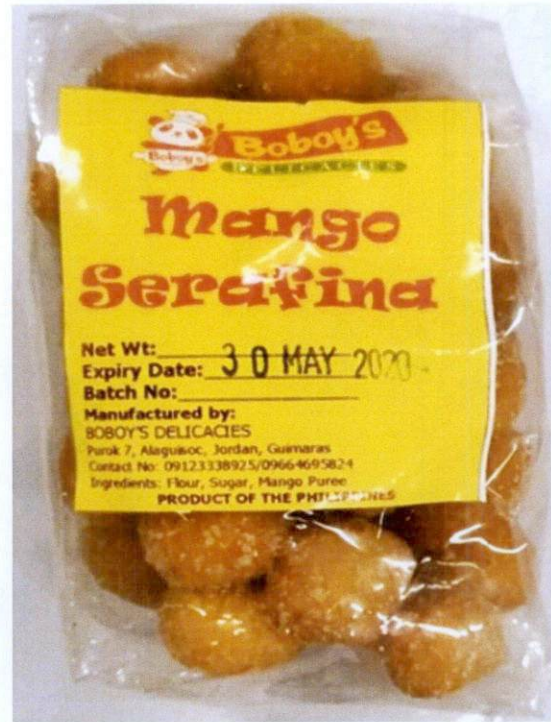
Figure 3. Unregistered BOBOY'S DELICACIES Mango Serafina