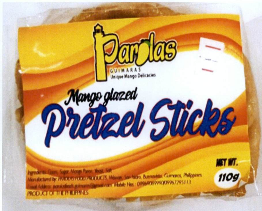
Figure 1. Unregistered PAROLAS GUIMARAS UNIQUE MANGO DELICACIES Mango Glazed Pretzel Sticks, Net Wt. 110g

The Food and Drug Administration (FDA) warns the public from purchasing and consuming the following unregistered food products: