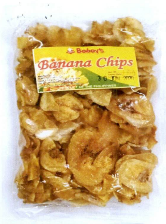
Figure 2. Unregistered BOBOY'S DELICACIES Banana Chips, Net Wt. 175g