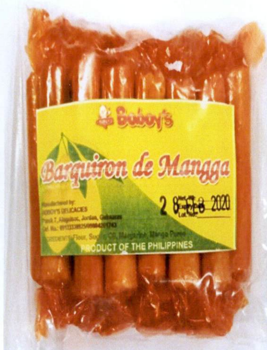
Figure 4. Unregistered BOBOY'S DELICACIES Barquiron de Mangga