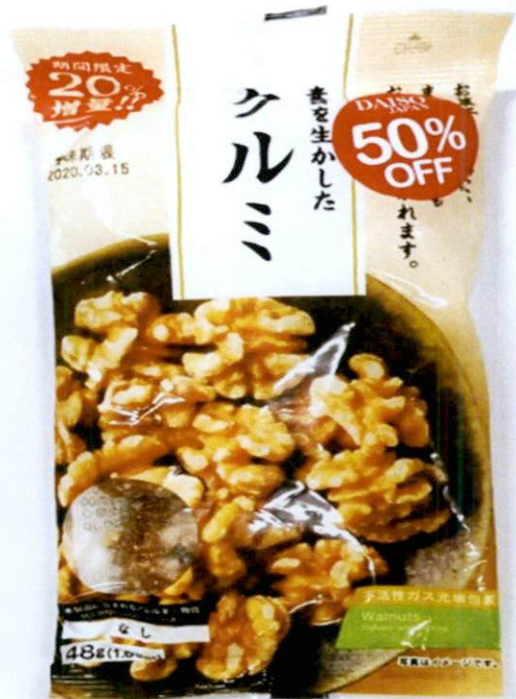
Figure 3. Unregistered Walnuts Halves Pieces, Net Wt. 48g (Labels Are In Foreign Characters)