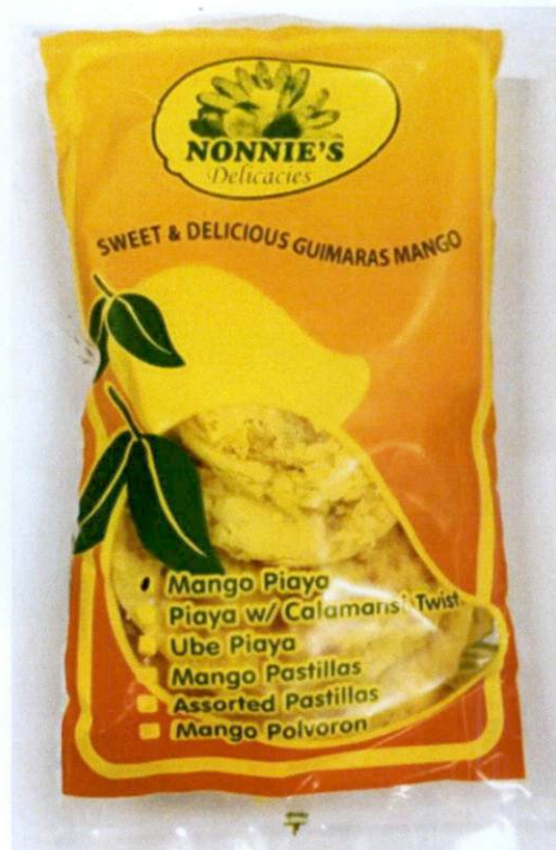
Figure 5. Unregistered NONNIE'S DELICACIES Mango Piaya