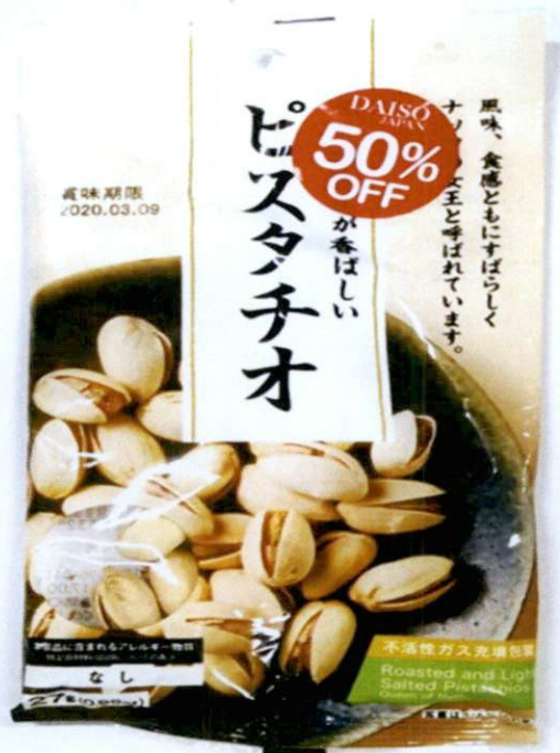
Figure 2. Unregistered Roasted and Lightly Salted Pistachios, Net Wt. 27g (Labels Are In Foreign Characters)