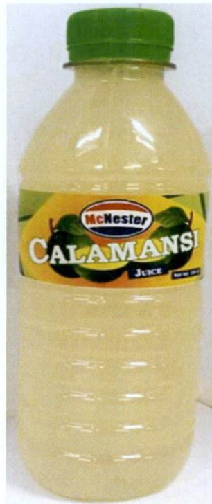
Figure 1. Unregistered MCNESTER Calamansi Juice, Net Wt.

The Food and Drug Administration (FDA) warns the public from purchasing and consuming the following unregistered food products: