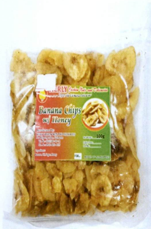
Figure 4. Unregistered MERLY CASHEW NUTS & DELICACIES Banana Chips with Honey, Net Wt. 100g