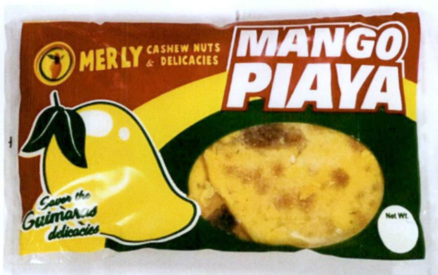
Figure 1. Unregistered MERLY CASHEW NUTS & DELICACIES Mango Piaya

The Food and Drug Administration (FDA) warns the public from purchasing and consuming the following unregistered food products: