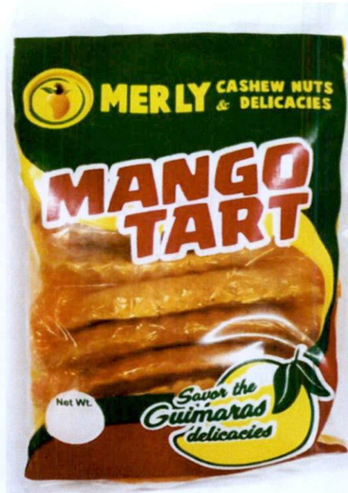
Figure 3. Unregistered MERLY CASHEW NUTS & DELICACIES Mango Tart