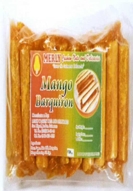
Figure 5. Unregistered MERLY CASHEW NUTS & DELICACIES Mango Barquiron