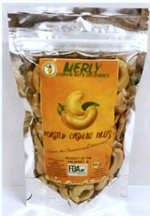
Figure 4. Unregistered MERLY CASHEW NUTS & DELICACIES Roasted Cashew Nuts, Net Wt. 100g