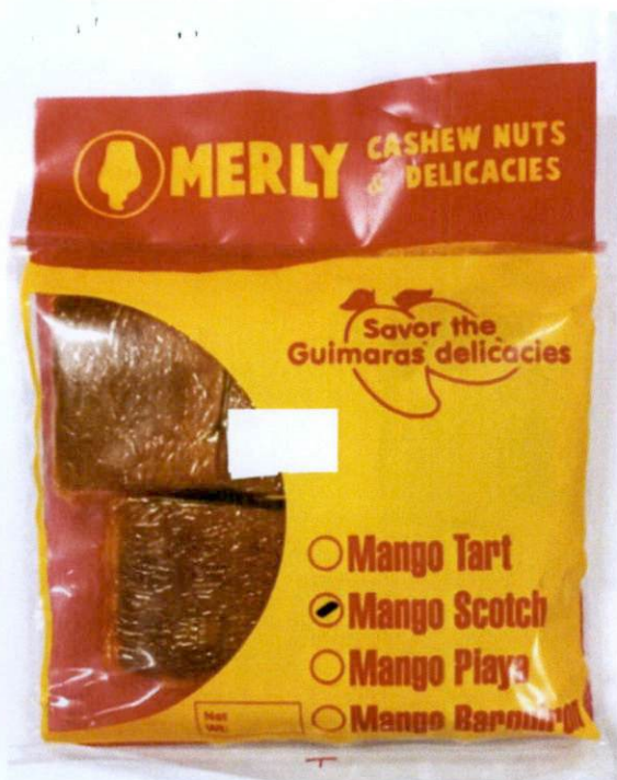
Figure 2. Unregistered (MERLY CASHEW NUTS & DELICACIES Mango Scotch