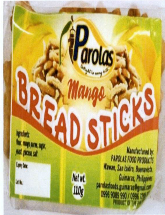
Figure 3. Unregistered PAROLAS Mango Bread Sticks, Net WT. 110g