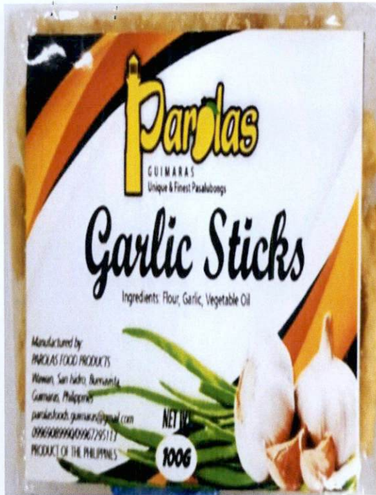
Figure 2. Unregistered PAROLAS Garlic Sticks, Net Wt. 100g