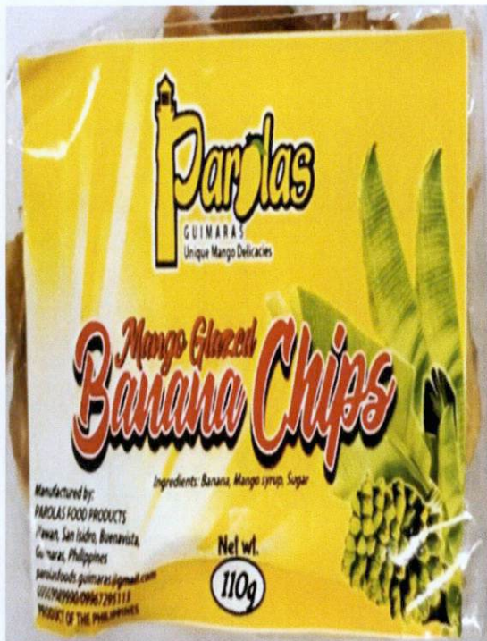
Figure 4. Unregistered PAROLAS Mango Glazed Banana Chips, Net Wt. 110g