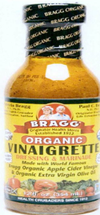
Figure 5. Unregistered BRAGG Organic Vinaigrette Dressing & Marinade, 345ml