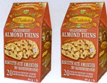
THINaddictives Cranberry Almond Thins

20 Freshness Packs of crunchy cookies This new flavor is taking the country by storm. It is crunchy and chewy, sweet 'n tart! No oil added. Zero Trans Fat! Dimensions: 10-1/2" h x 5-1/4" w x 4 3/4" D Net Weight: 45g /16 oz Imported from Canada