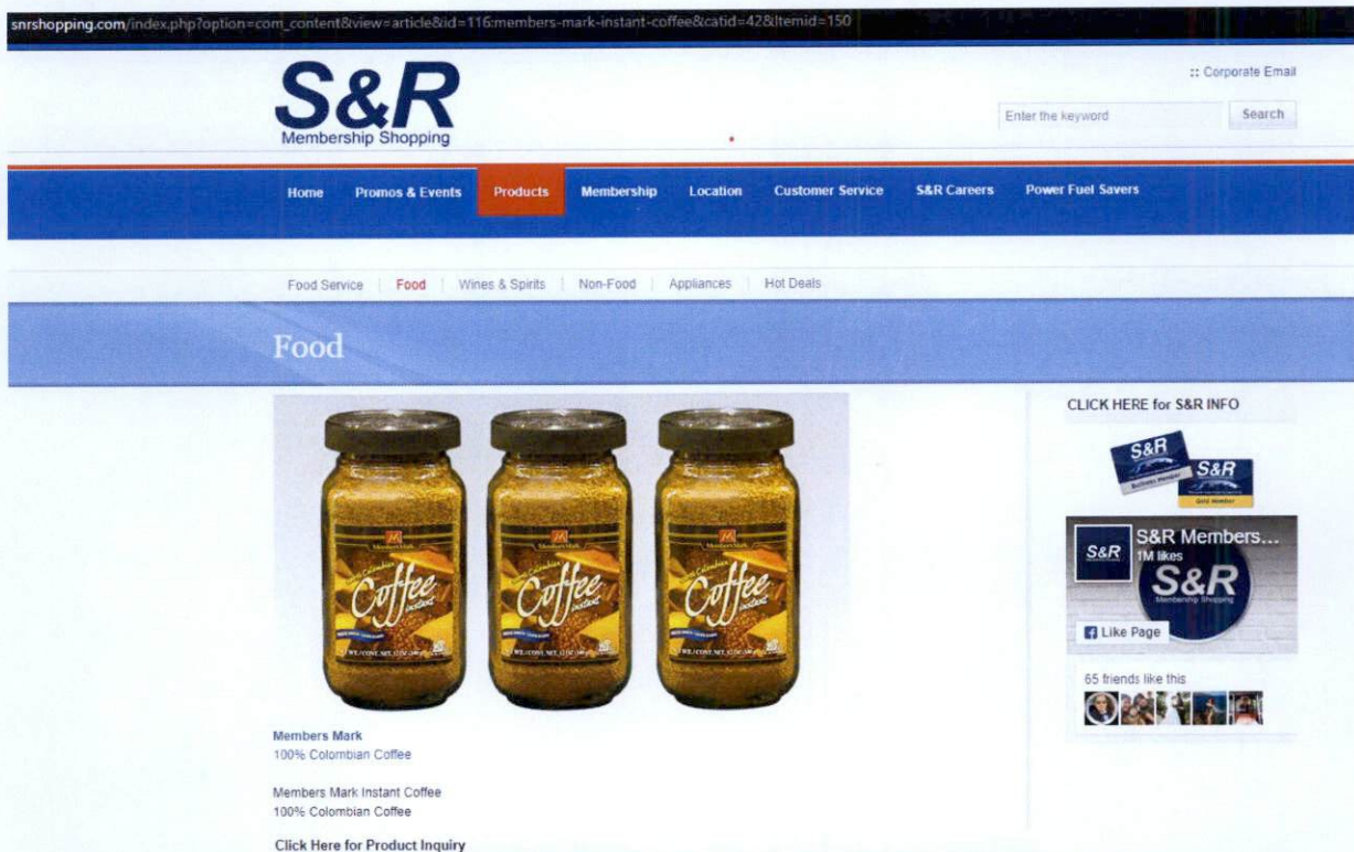
Figure 1. Unregistered MEMBER'S MARK 100% Columbian Coffee Instant

The Food and Drug Administration (FDA) advises the public from purchasing and consuming the following unregistered food products: