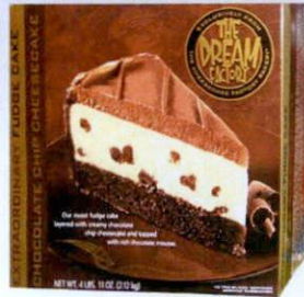
The Dream Factory Fudge Cake