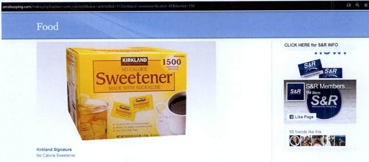
Figure 4. Unregistered KIRKLAND SIGNATURE Sweetener made With Sucralose