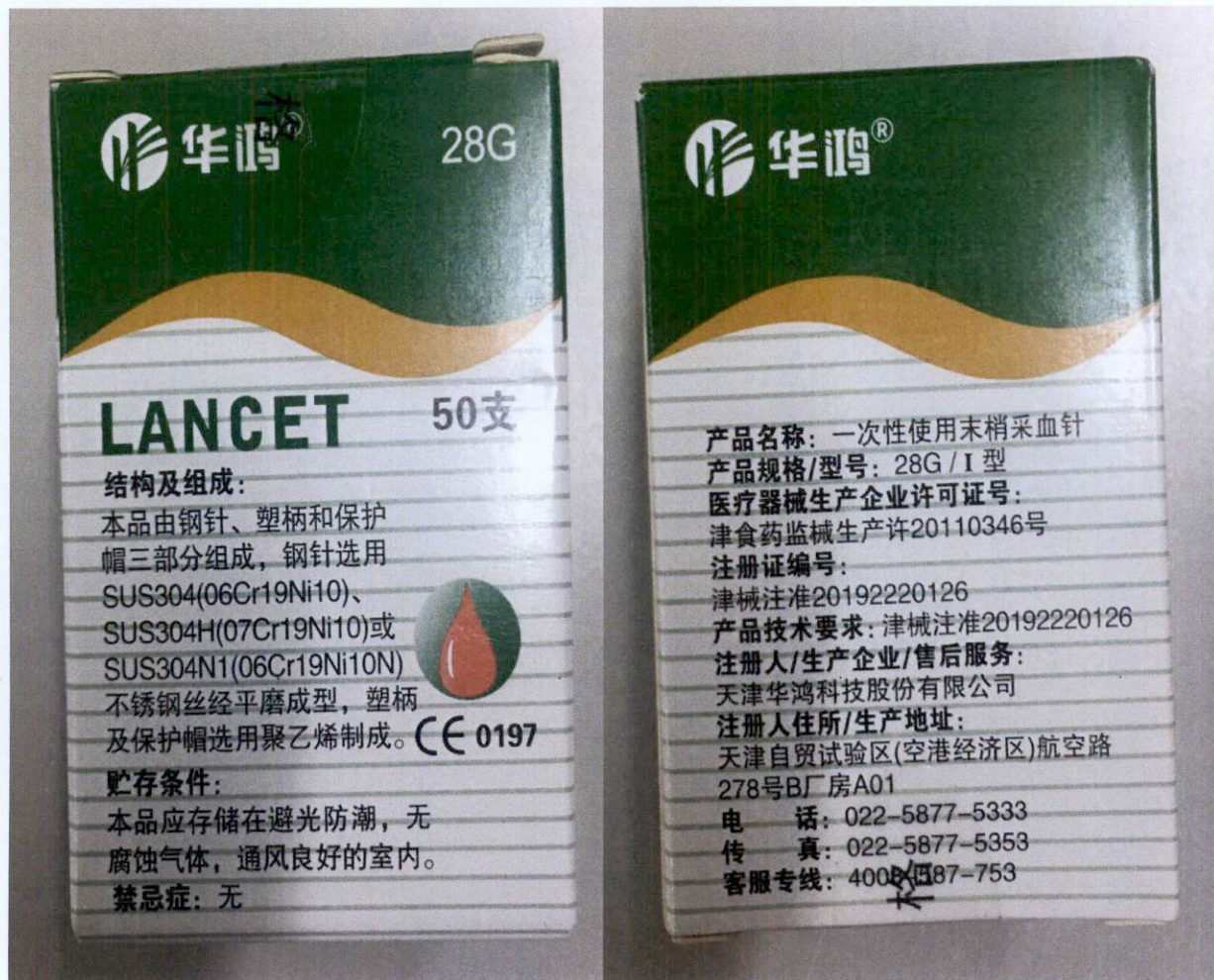
Figure 1. Unregistered Lancet

The Food and Drug Administration (FDA) warns all healthcare professionals and the general public against the purchase and use of the unregistered medical device: