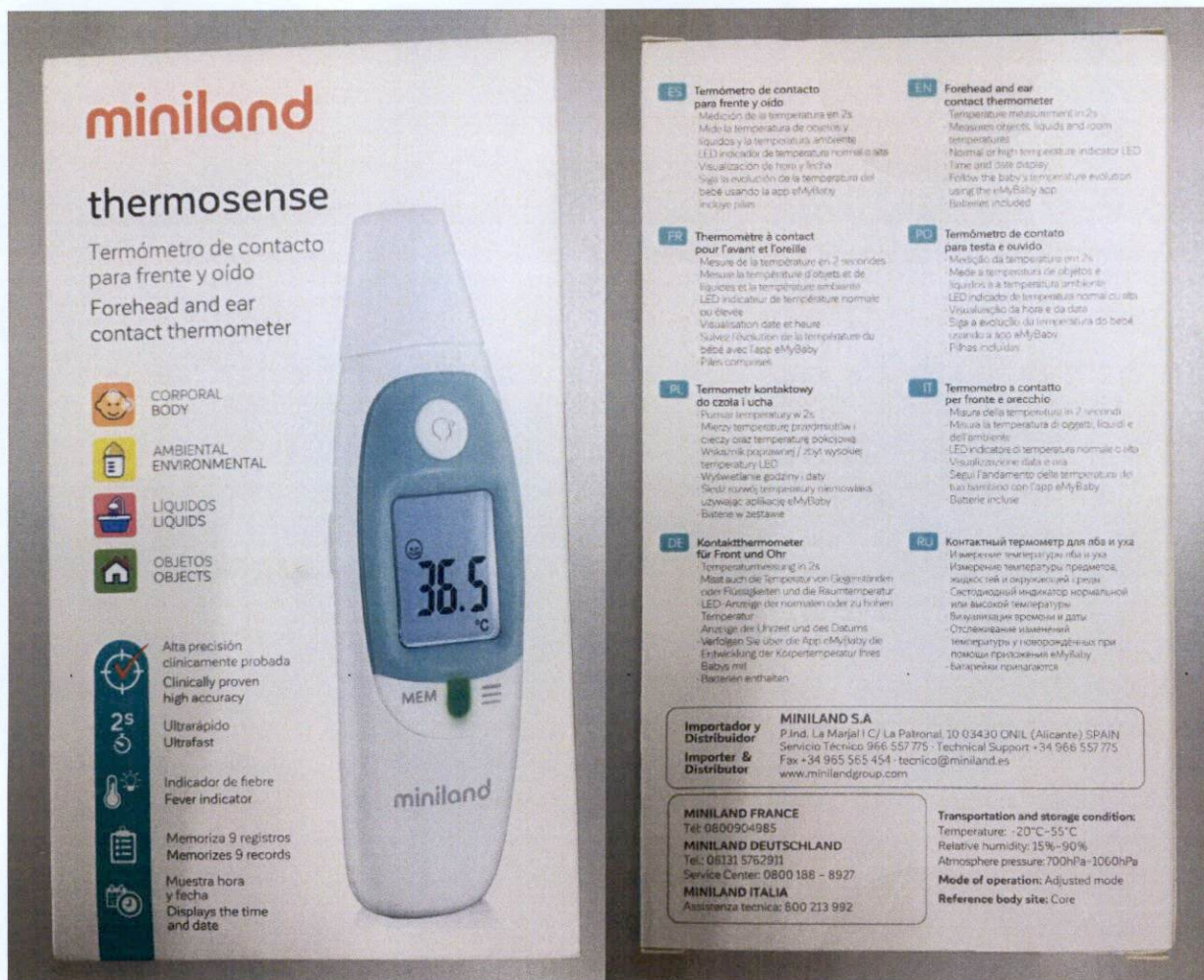
Figure 1. Unregistered Miniland Thermosense Forehead and Ear Contact Thermometer

The Food and Drug Administration (FDA) warns all healthcare professionals and the general public against the purchase and use of the unregistered medical device: