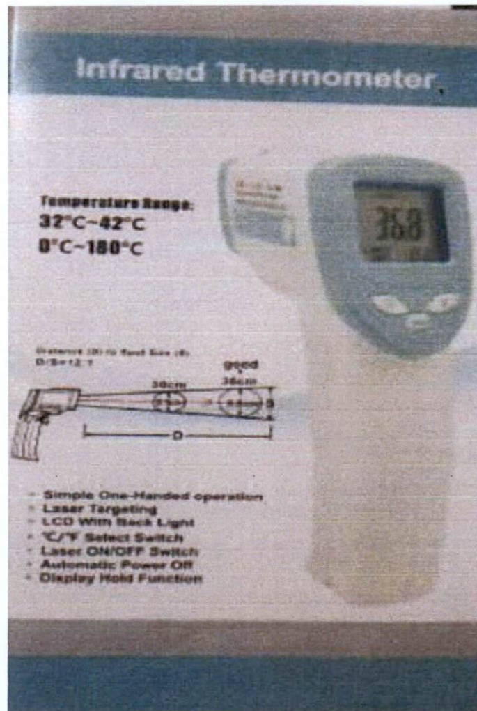
Figure 1. Unregistered Infrared Thermometer

The Food and Drug Administration (FDA) warns all healthcare professionals and the general public against the purchase and use of the unregistered medical device: