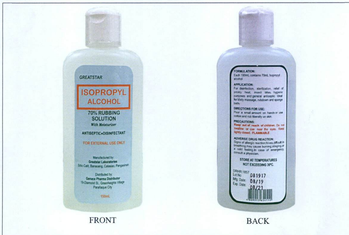
Figure 1. Isopropyl Alcohol 70% Rubbing Solution with Moisturizer for recall