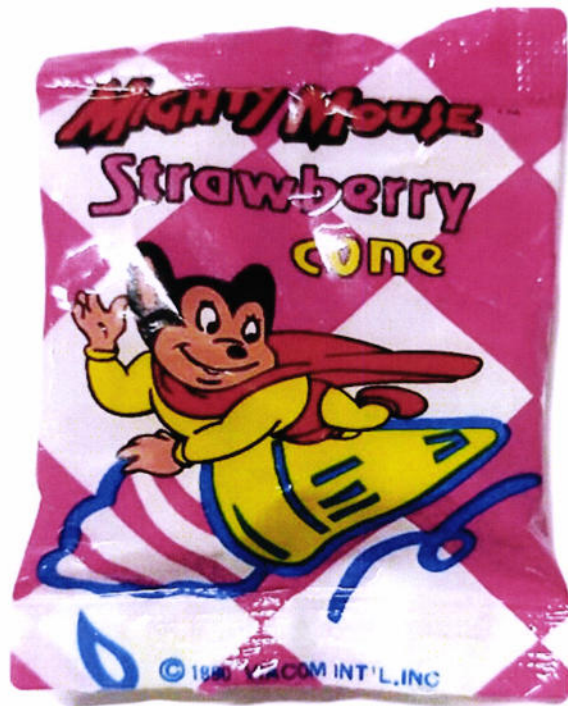
Figure 2. Unregistered MIGHTY MOUSE Strawberry Cone