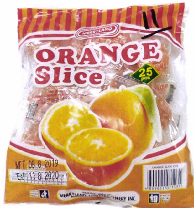
Figure 1. Unregistered MERRYLAND Orange Slice,25pcs

The Food and Drug Administration (FDA) warns the public from purchasing and consuming the following unregistered food products: