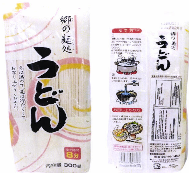
Figure 4. Unregistered SHOWA UDON Thick Wheat Noodle

The FDA verified through post-marketing surveillance that the above mentioned food products are not authorized and the Certificates of Product Registration have not been issued. Pursuant to the Republic Act No. 9711, otherwise known as the “Food and Drug Administration Act of 2009”, the manufacture, importation, exportation, sale, offering for sale, distribution, transfer, non-consumer use, promotion, advertising or sponsorship of health products without the proper authorization is prohibited.