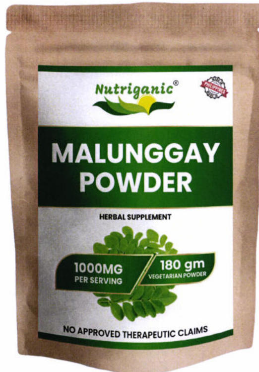
Figure 1. Unregistered NUTRIGANIC Malunggay Powder Herbal Supplement

The Food and Drug Administration (FDA) warns the public from purchasing and consuming the following unregistered food supplements: