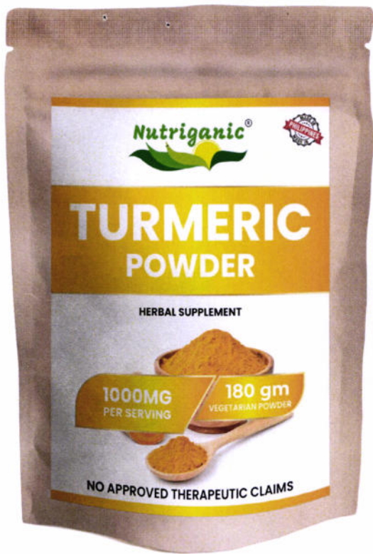
Figure 2. Unregistered NUTRIGANIC Turmeric Powder Herbal Supplement