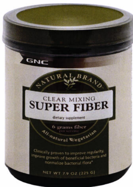
Figure 4. Unregistered GNC Natural Brand Clear Mixing Super Fiber, Dietary Supplement, 6 Grams Fiber