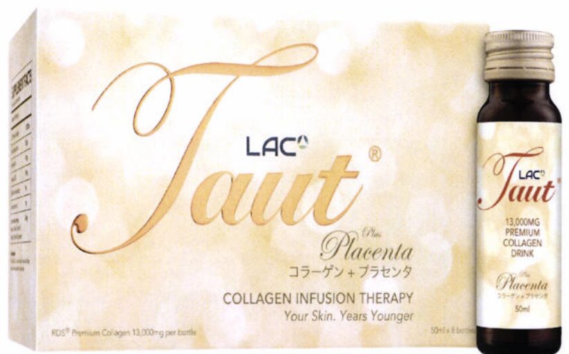
Figure 5. Unregistered LAC Taut Plus Placenta Collagen Infusion Therapy 50ml x 8 bottles