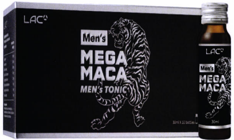
Figure 3. Unregistered Lac Men's Mega Maca Mens Tonic