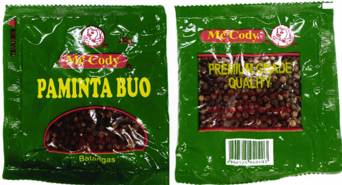
Figure 1. Unregistered MC CODY Paminta Buo, 30g

The Food and Drug Administration (FDA) warns the public from purchasing and consuming the following unregistered food products: