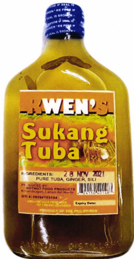
Figure 4. Unregistered KWEN'S KWEN'S Sukang Tuba