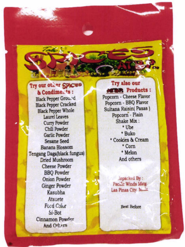
Figure 2. Unregistered TABI'S Spices Atbp..., Black Pepper Cracked, 30gms