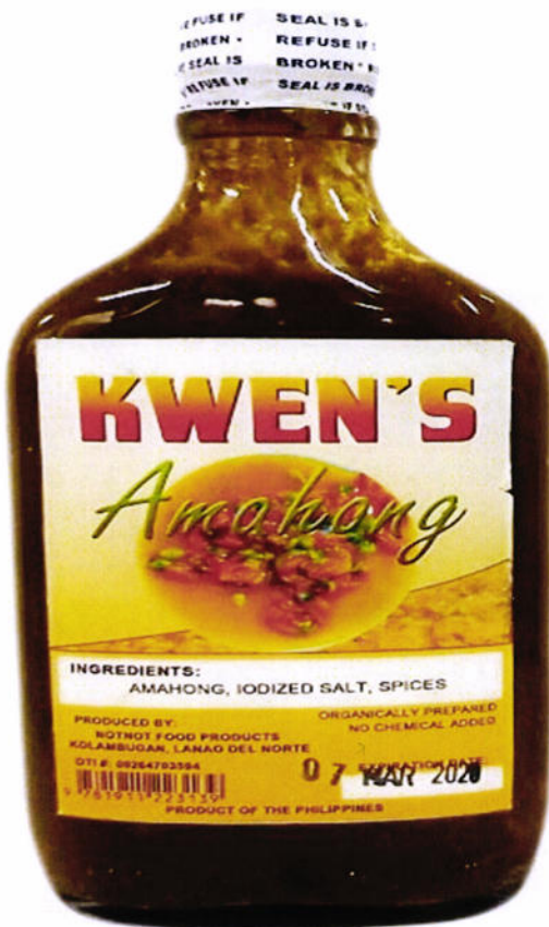
Figure 3 Unregistered KWEN'S Amahong