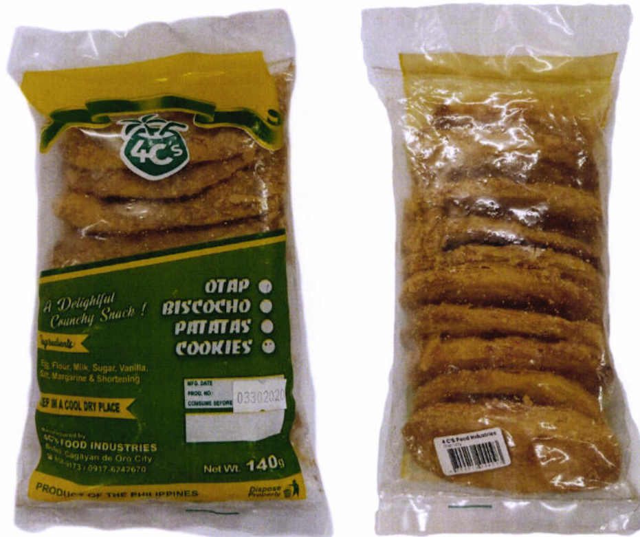
Figure 5. Unregistered 4C'S Otap, 140g

The FDA verified through post-marketing surveillance that the above mentioned food products are not authorized and the Certificates of Product Registration have not been issued. Pursuant to the Republic Act No. 9711, otherwise known as the “Food and Drug Administration Act of 2009”, the manufacture, importation, exportation, sale, offering for sale, distribution, transfer, non-consumer use, promotion, advertising or sponsorship of health products without the proper authorization is prohibited.