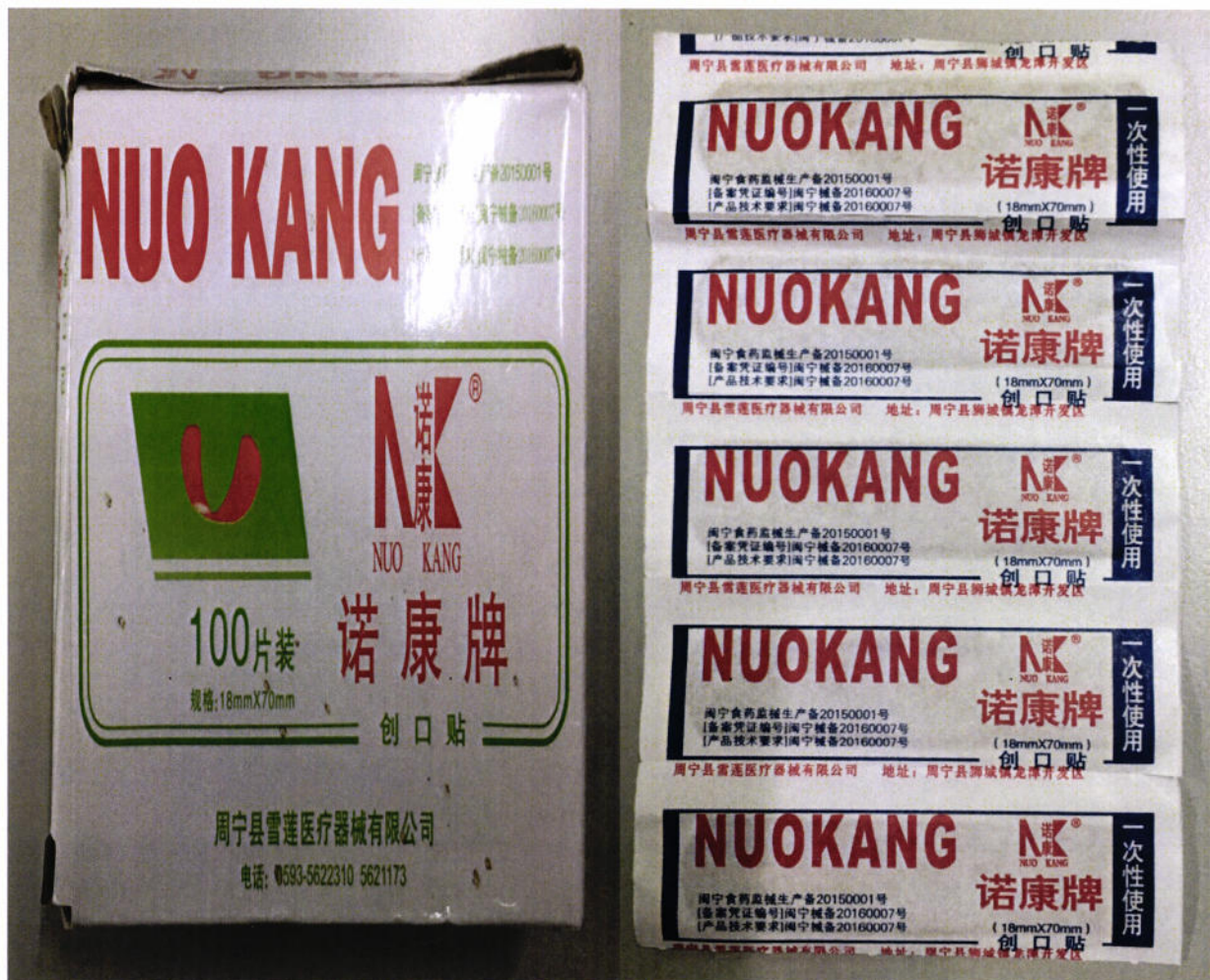
Figure 1. Unnotified Nuo Kang Adhesive Bandage

The Food and Drug Administration (FDA) warns all healthcare professionals and the general public against the purchase and use of the unnotified medical device: