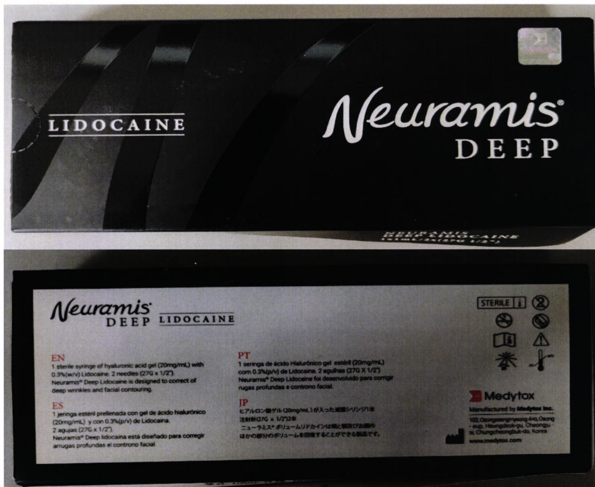
Figure 2. Unregistered Neuramis ® Deep Lidocaine 1x1mL/2x(27G ½”)

The FDA verified through post-marketing surveillance that the abovementioned medical devices are not registered and the Certificates of Product Registration (CPR) have not yet been issued. Pursuant to the Republic Act No. 9711, otherwise known as the “Food and Drug Administration Act of 2009”, the manufacture, importation, exportation, sale, offering for sale, distribution, transfer, non-consumer use, promotion, advertising or sponsorship of health products without the proper authorization is prohibited.