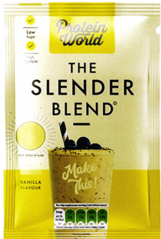
Figure 3. Unregistered PROTEIN WORLD Slender Blend Sachet, Vanilla Flavor