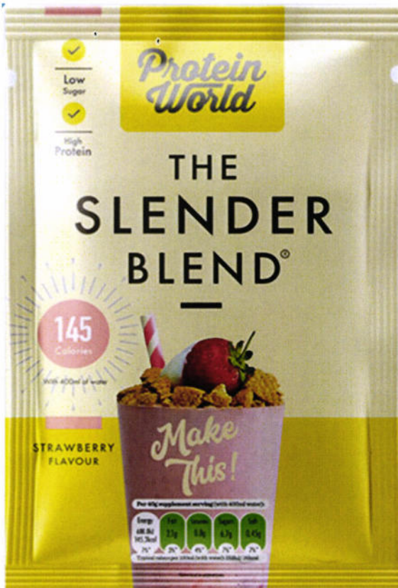
Figure 2. Unregistered PROTEIN WORLD Slender Blend Sachet, Strawberry Flavor