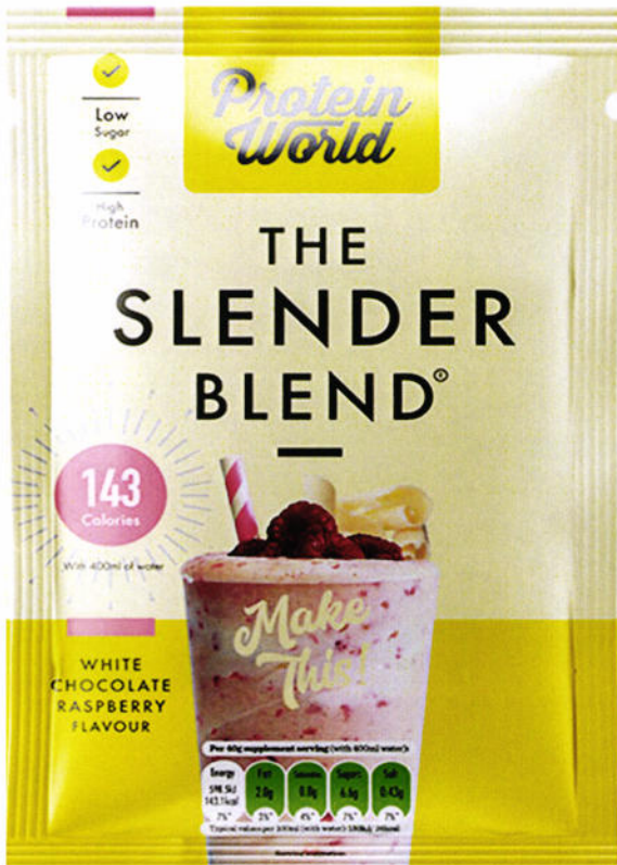
Figure 4. Unregistered PROTEIN WORLD Slender Blend Sachet, White Chocolate Raspberry Flavor