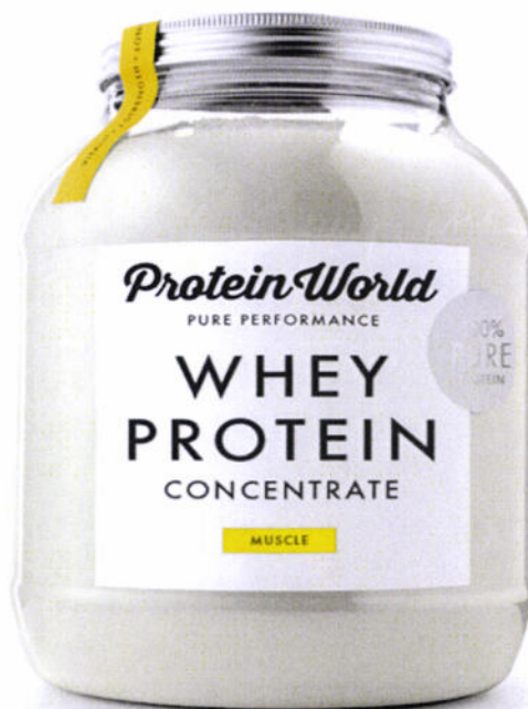
Figure 1. Unregistered PROTEIN WORLD Whey Protein Concentrate Muscle Building Shake

The Food and Drug Administration (FDA) warns the public from purchasing and consuming the following unregistered food products and food supplements: